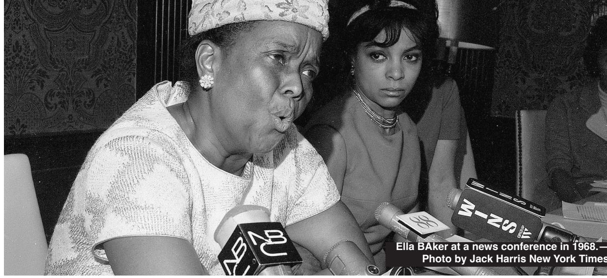
Ella Baker at a news conference in 1968.

Baker's philosophy was in contrast to that of many Black (religious) leaders, including Dr. Martin Luther King, Jr., who was a victim of the era, defined by misogyny; a fact that the Negroocracy at the time sought to sweep under the tattered rug.