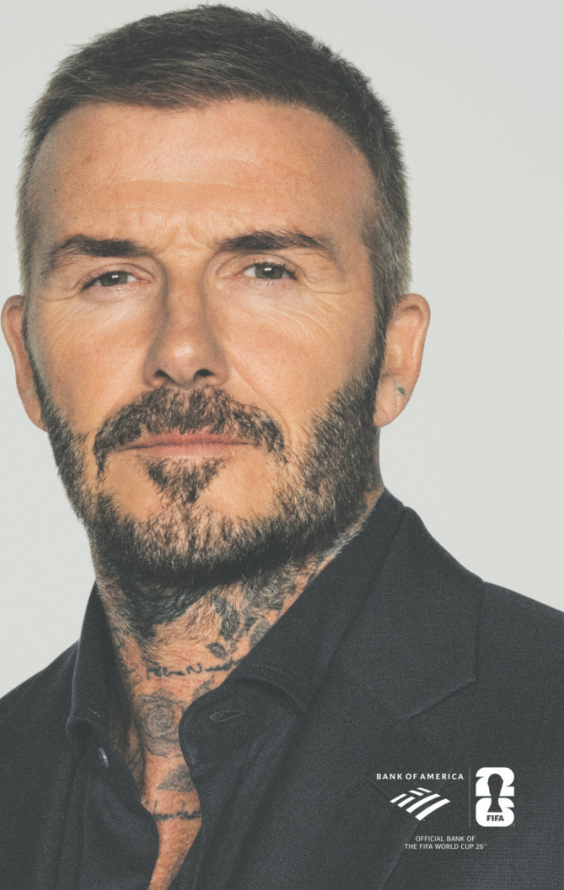
Sir David Beckham Soccer Club Owner and Businessman

Explore winning business solutions bofa.com/gamechangers