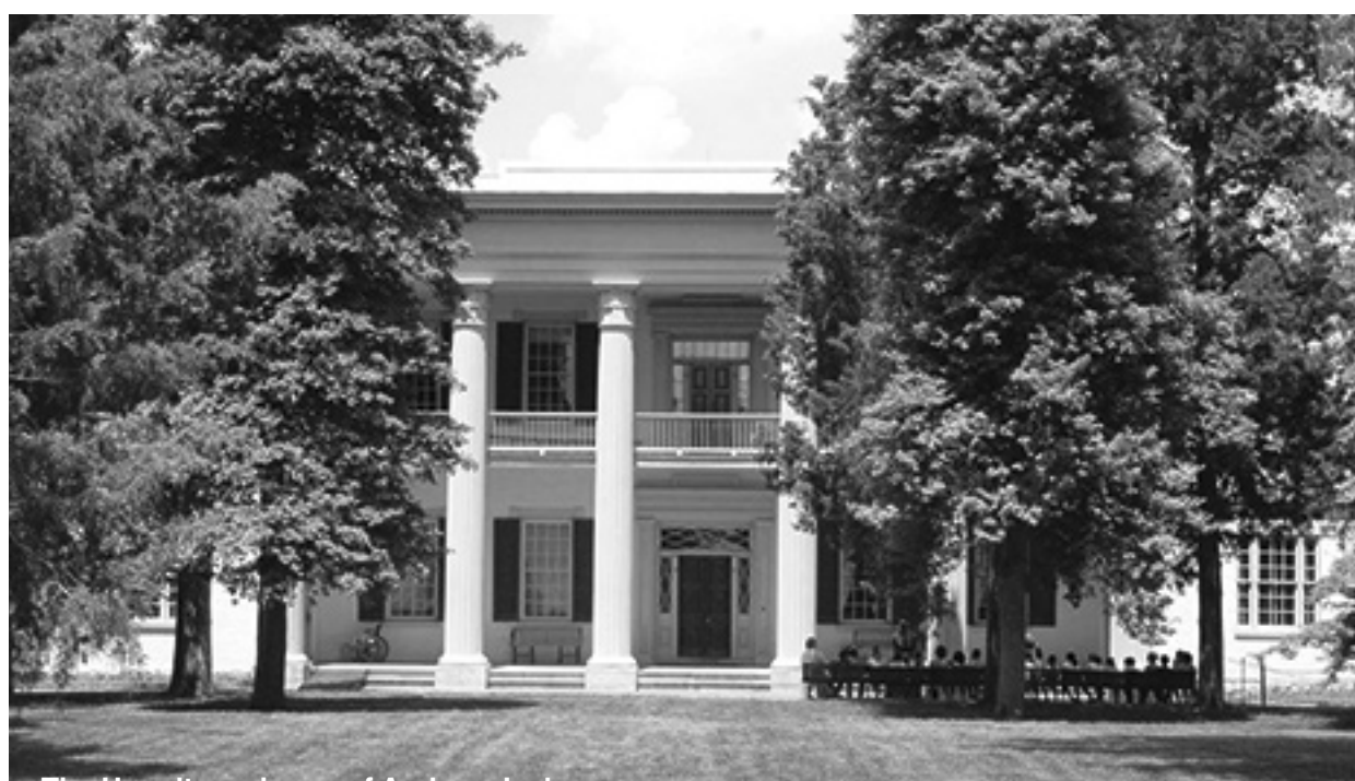
The Hermitage, home of Andrew Jackson

Robert E. Lee is my cousin too. He took up arms to keep my other ancestors in chains. I carry the blood of the man who argued for freedom and the