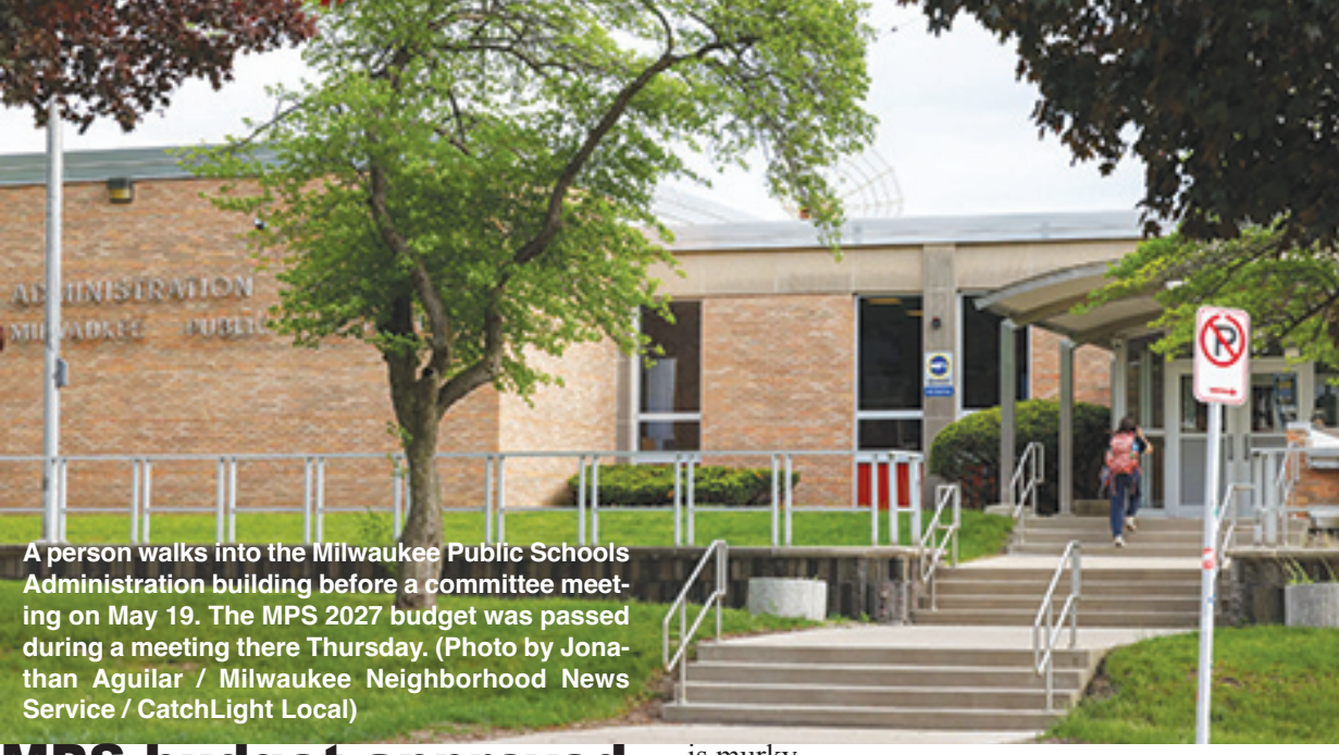
A person walks into the Milwaukee Public Schools Administration building before a committee meeting on May 19. The MPS 2027 budget was passed during a meeting there Thursday.