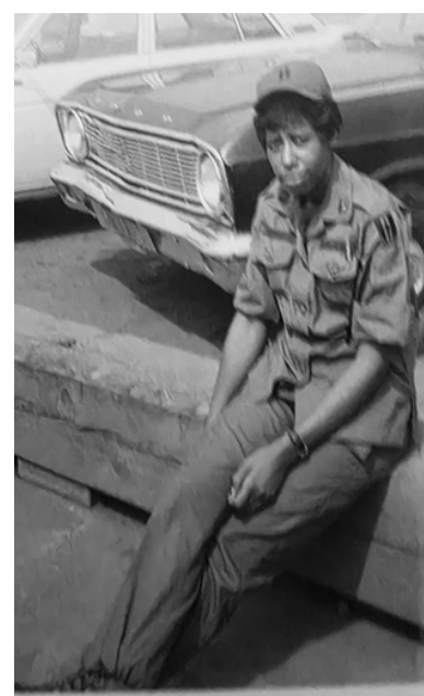
Theta Sorority—a member of the Gamma Tau chapter.