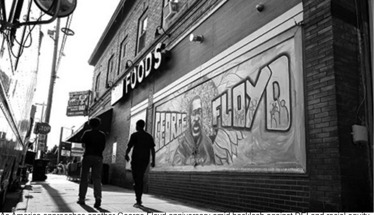
As America approaches another George Floyd anniversary amid backlash against DEI and racial equity efforts, Black clergy say the church remains one of the few institutions still preserving the spiritual and political memory of Floyd's murder and the reckoning it forced upon the nation.