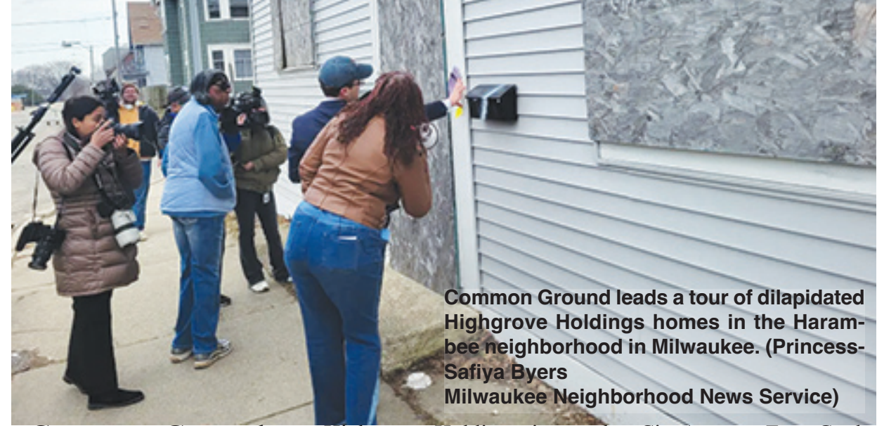
Common Ground leads a tour of dilapidated Highgrove Holdings homes in the Harambee neighborhood in Milwaukee.