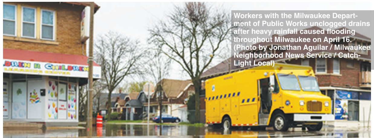
Workers with the Milwaukee Department of Public Works unclogged drains after heavy rainfall caused flooding throughout Milwaukee on April 16.

Alec also reestablished the student organization YES (Youth Empowered in the Struggle) at (continued on page 4)