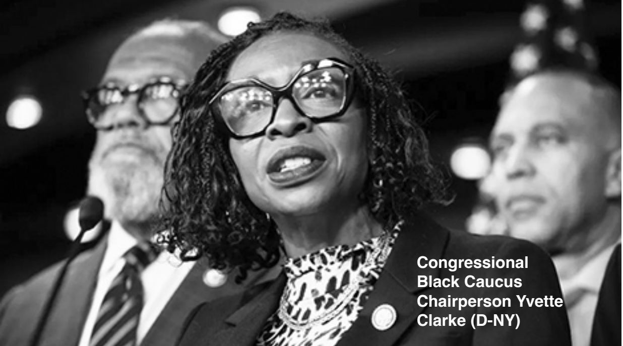
Congressional Black Caucus Chairperson Yvette Clarke (D-NY)