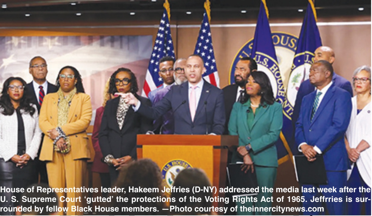
House of Representatives leader, Hakeem Jeffries (D-NY) addressed the media last week after the U. S. Supreme Court 'gutted' the protections of the Voting Rights Act of 1965. Jeffries is surrounded by fellow Black House members.