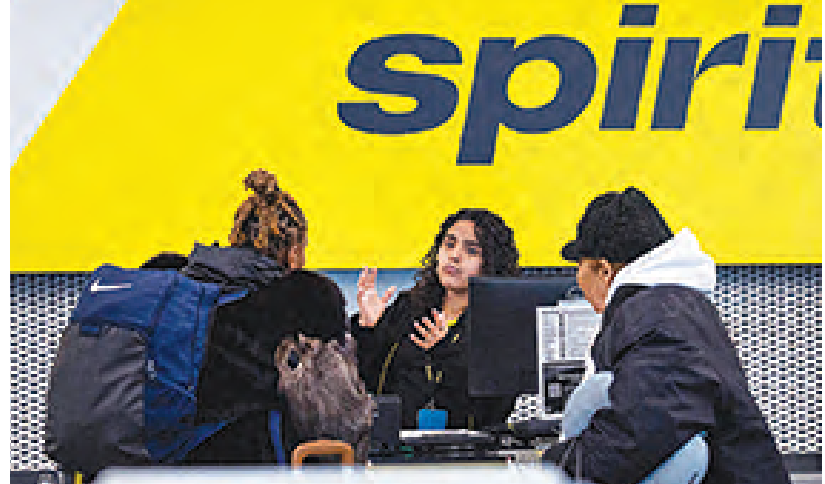
Passengers check in for their Spirit Airlines flights at O'Hare Airport on March 10, 2026 in Chicago, Illinois. The budget airline plans to cut flights, downsize its fleet and recall furloughed pilots in a bid to emerge from bankruptcy as early as the spring.

News that the end was near first surfaced in mid-April,