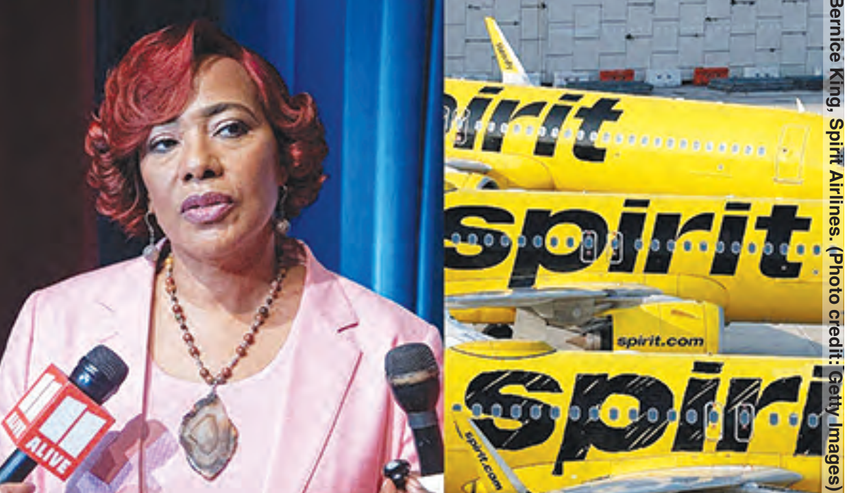
Bernice King: Spirit Airlines.

BERNICE KING speaks out about Spirit Airlines' 17,000 employees amid closure: