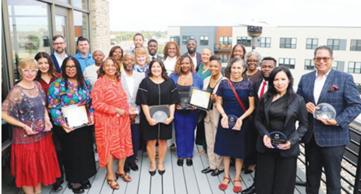
Honorees from the 2025 Milwaukee County Health Equity Champion Award gather for a picture atop Nō Studios, located at 1037 W. McKinley Avenue in Milwaukee.