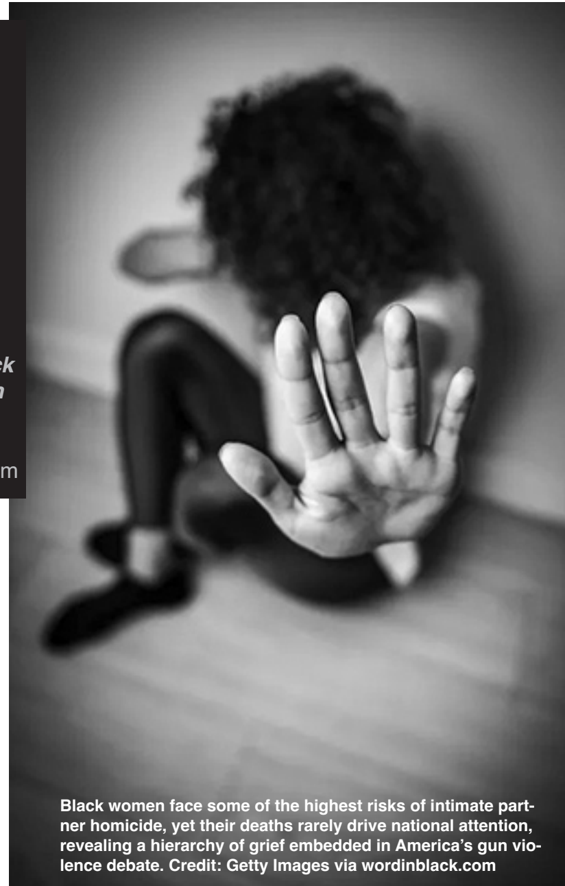
Black women face some of the highest risks of intimate partner homicide, yet their deaths rarely drive national attention, revealing a hierarchy of grief embedded in America's gun violence debate.

As a gun safety activist, I have worked tirelessly alongside others to help shift the narratives that define