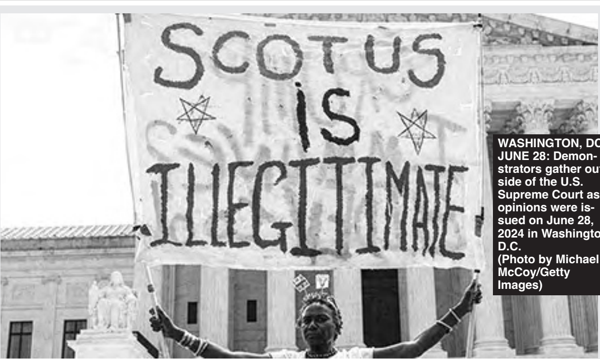
WASHINGTON, DC - JUNE 28: Demonstrators gather outside of the U.S. Supreme Court as opinions were issued on June 28, 2024 in Washington, D.C.

This project was made possible by the Advancing a Healthier Wisconsin Endowment and the Medical College of Wisconsin—and, most importantly, by the more than 100 older adults who shared their stories with us. Their candor and courage are what make this report matter.