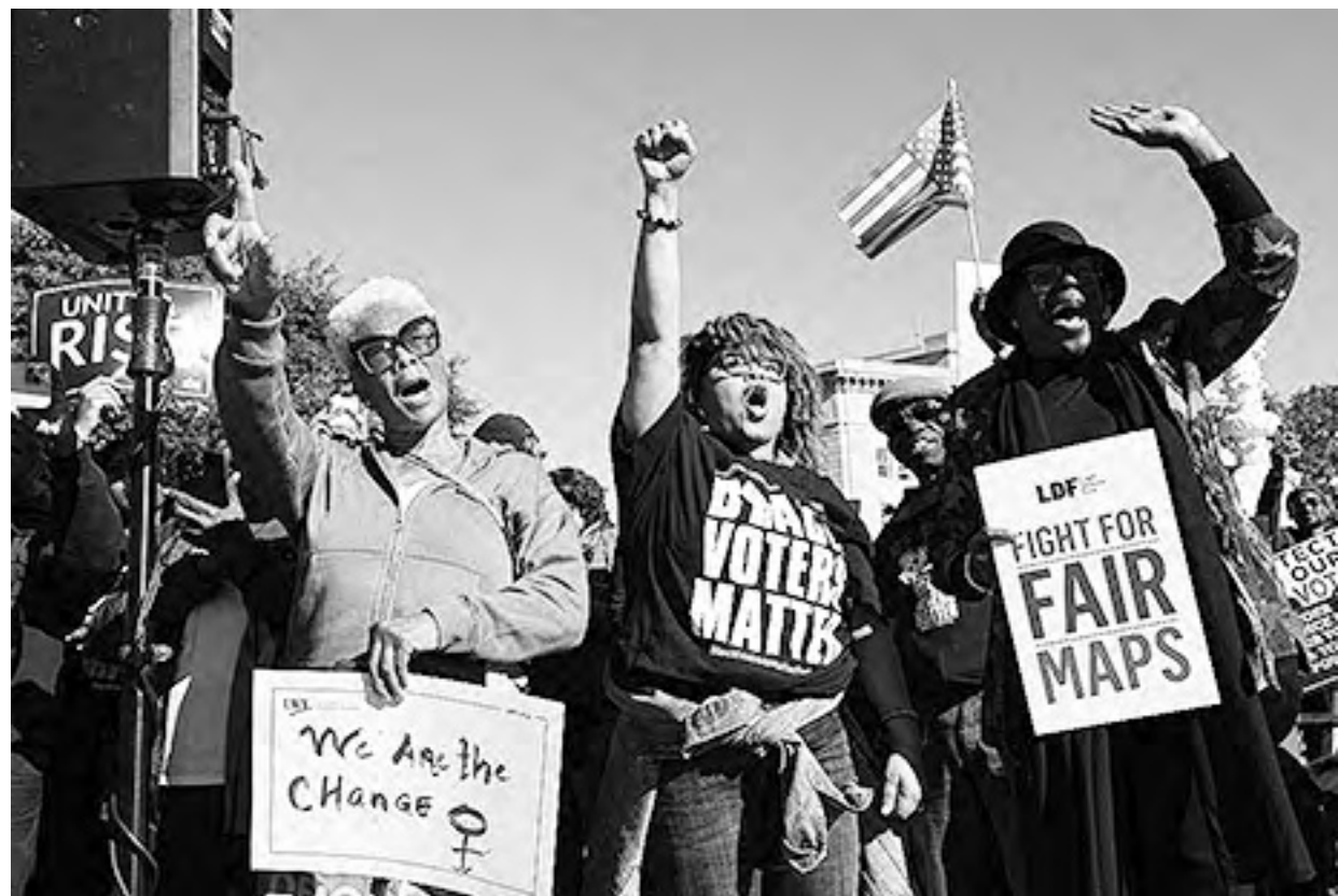
WASHINGTON, DC – OCTOBER 15: Activists and participants gather in front of the Supreme Court of the United States during Supreme Court re-argument of Louisiana v. Callais on October 15, 2025 in Washington, DC.

The Congressional Black Caucus, which stands to be most deeply impacted by the SCOTUS decision, said the "legitimacy" of the Supreme Court has been "deeply undermined by this deci-