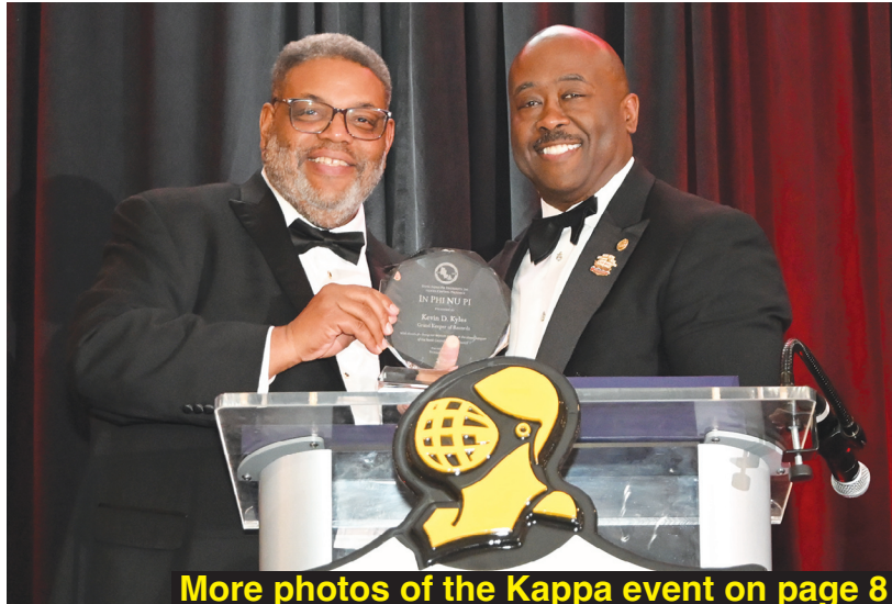
More photos of the Kappa event on page 8