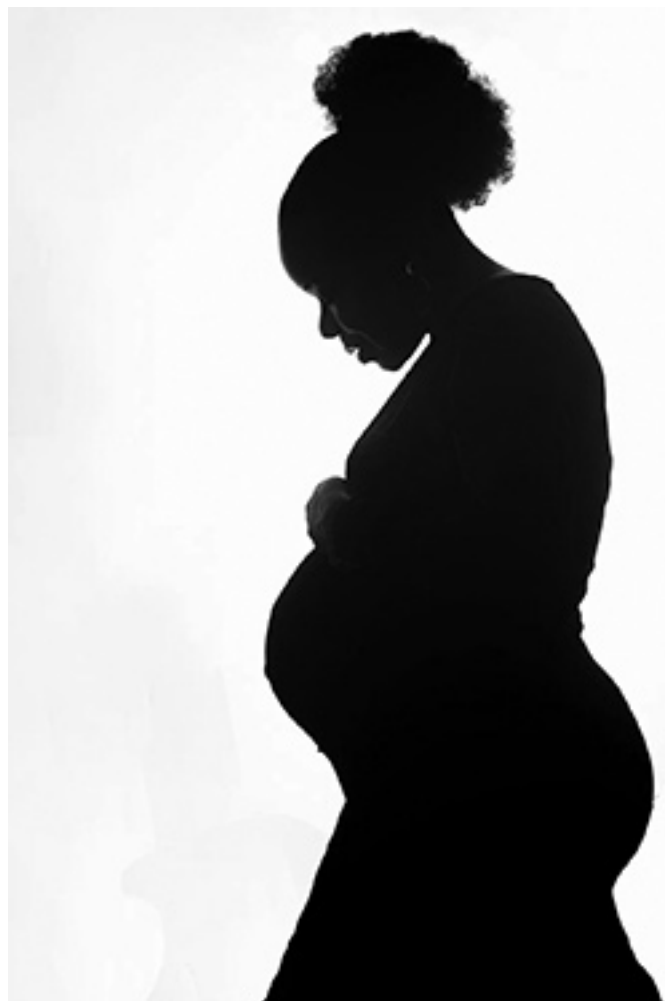
Silhouette of a pregnant woman

While his patients believed they were receiving quality medical care and guidance, he betrayed their confidence. Not all cases of medical racism are this extreme or blatant. But the experience of feeling mis-