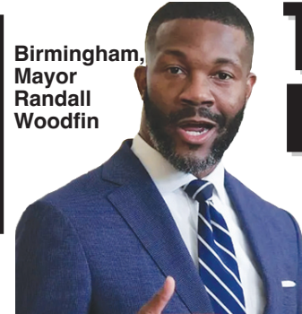
Birmingham, Mayor Randall Woodfin

The Democratic Mayor Who's Getting Black Men Right!