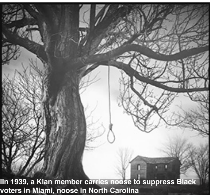
In 1939, a Klan member carries noose to suppress Black voters in Miami, noose in North Carolina

Talk to your health care provider about cholesterol-lowering medications, which can help lower bad cholesterol and reduce the risks associated with heart disease.