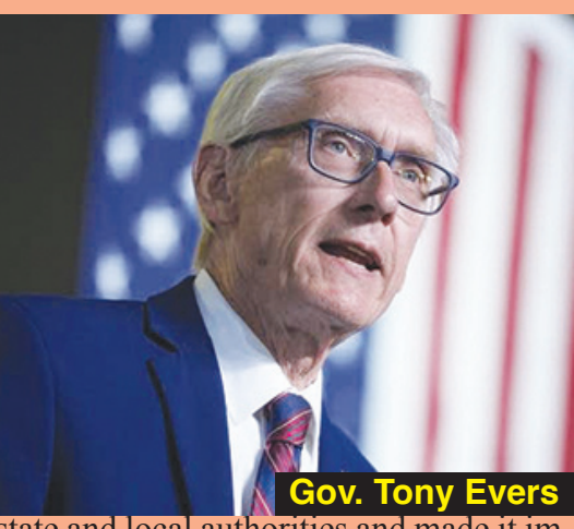
Gov. Tony Evers

MADISON — Gov. Tony Evers announced recently a new lawsuit filing by the state in support of Minnesota’s lawsuit challenging President Donald J. Trump and the Trump Administration’s deployment of U.S. Immigration and Customs Enforcement (ICE) and U.S. Border Patrol in Minnesota. Minnesota is also petitioning for a temporary restraining order against the federal government’s actions. Wisconsin is among a coalition of states that “have a strong interest in ensuring that federal immigration enforcement is not used as an excuse to infringe the sovereignty of the States,” the filing states. “Under the claimed auspices of carrying out immigration enforcement, the federal government has seriously undermined