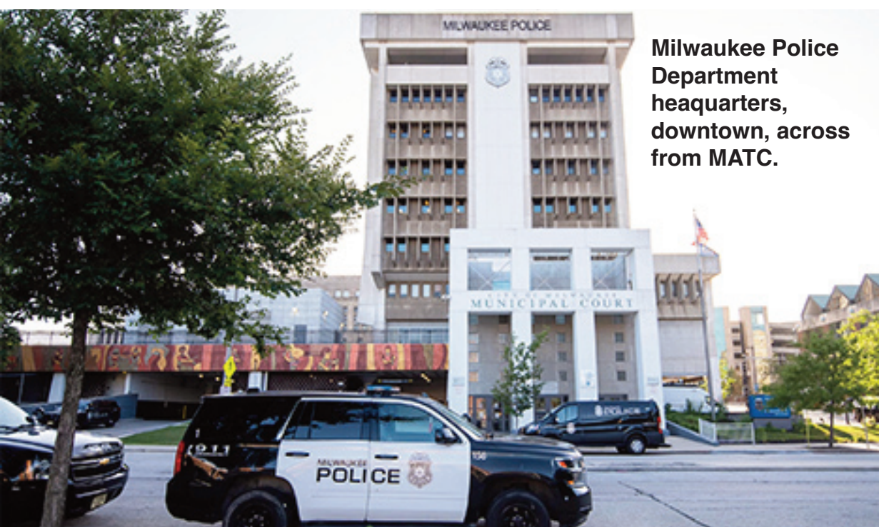
Milwaukee Police Department headquarters, downtown, across from MATC.