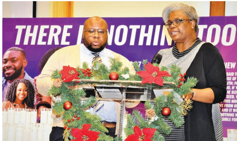
Connections Inc. and co-founder of MKE Black Grassroots Network for Health Equity, reflecting on this year's shared commitment.