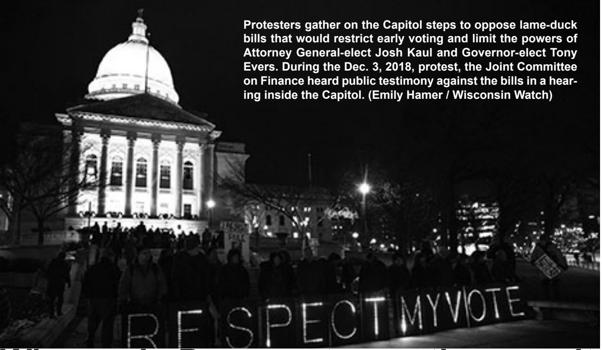
Protesters gather on the Capitol steps to oppose lame-duck bills that would restrict early voting and limit the powers of Attorney General-elect Josh Kaul and Governor-elect Tony Evers. During the Dec. 3, 2018, protest, the Joint Committee on Finance heard public testimony against the bills in a hearing inside the Capitol.