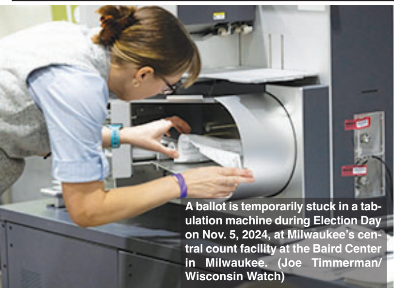
A ballot is temporarily stuck in a tabulation machine during Election Day on Nov. 5, 2024, at Milwaukee's central count facility at the Baird Center in Milwaukee.