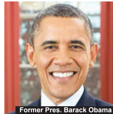
Former Pres. Barack Obama

Republican attacks intensified the moment the bill became law, but the pursuit of its destruction began before a single vote was cast. It followed the same path as the claims that Obama was not born in the United States.