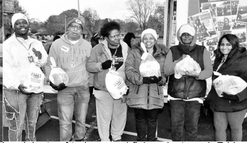
Approximately 366 local families were the blessed recipients of turkeys and fixings last week Friday during the annual holiday turkey and groceries giveaway, compliments of Brentwood Church of Christ, 6425 N. 60th St. The event is one of many the church holds throughout the year in order to connect with the surrounding neighborhood and its residents.