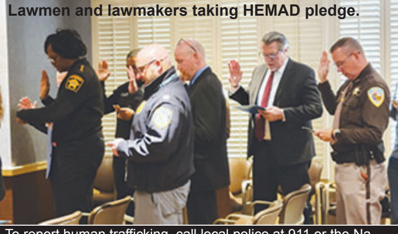
Lawmen and lawmakers taking HEMAD pledge.

"Eighty percent of human trafficking cases in the U.S. involve sex trafficking. To stop sex trafficking, we need to address the demand - and that