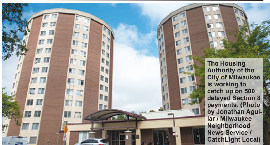
The Housing Authority of the City of Milwaukee is working to catch up on 500 delayed Section 8 payments.