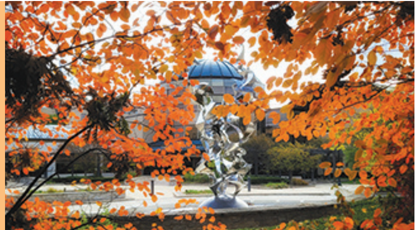
The rotunda at Alverno College framed by autumn leaves.

This marks the sixteenth consecutive year Alverno was recognized in this category, the only college in the state included in this category for its entire 16-year history.