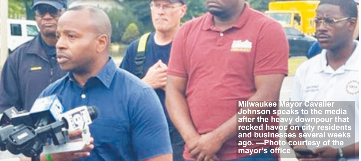
Milwaukee Mayor Cavalier Johnson speaks to the media after the heavy downpour that reeked havoc on city residents and businesses several weeks ago.