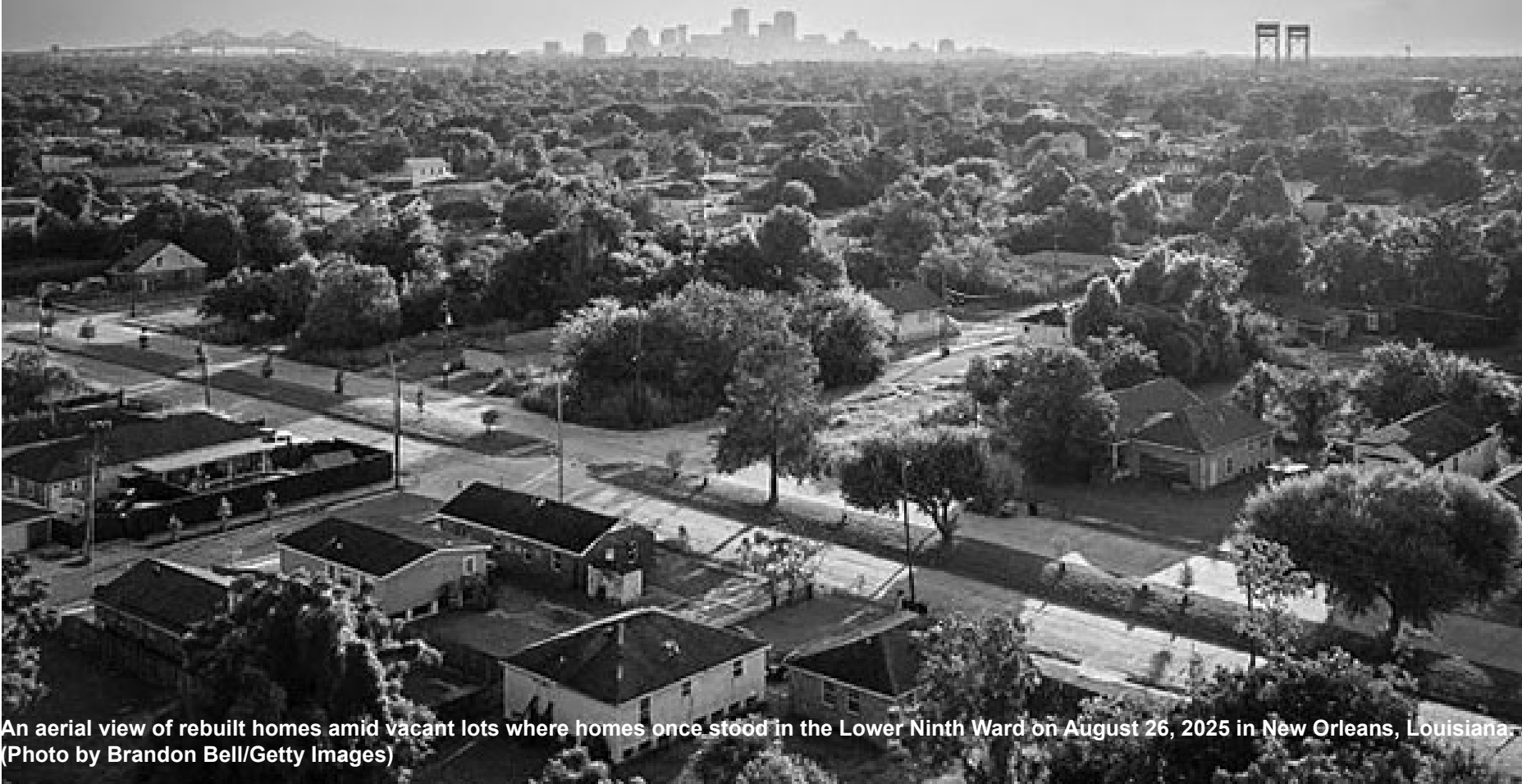
An aerial view of rebuilt homes amid vacant lots where homes once stood in the Lower Ninth Ward on August 26, 2025 in New Orleans, Louisiana.