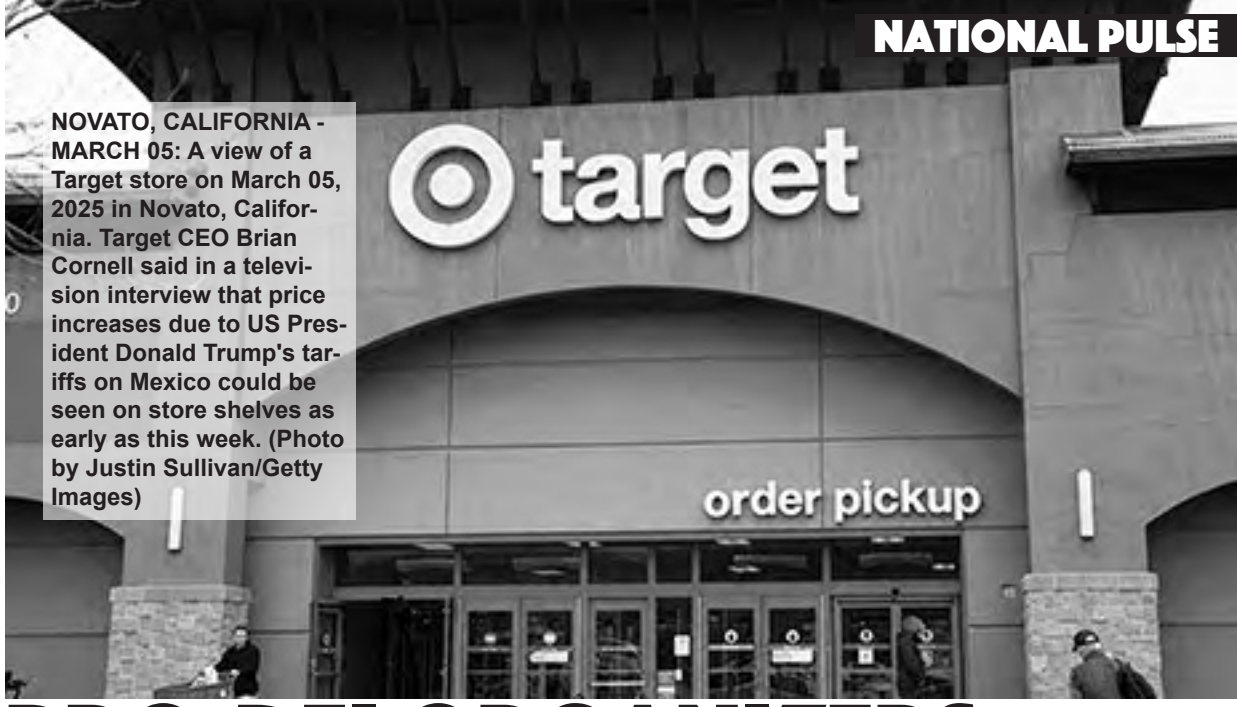
NOVATO, CALIFORNIA - MARCH 05: A view of a Target store on March 05, 2025 in Novato, California. Target CEO Brian Cornell said in a television interview that price increases due to US President Donald Trump's tariffs on Mexico could be seen on store shelves as early as this week.