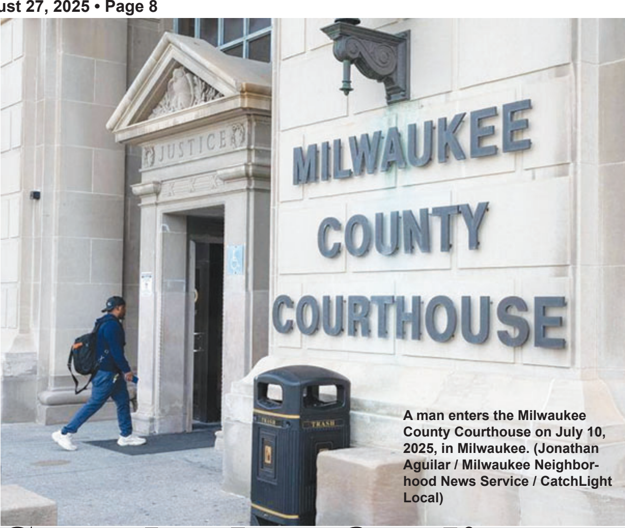
A man enters the Milwaukee County Courthouse on July 10, 2025, in Milwaukee.

Established in 1848 under the state constitution, the Common School Fund is used by public schools to purchase school library books and instructional materials and may be the only source of library funding for some