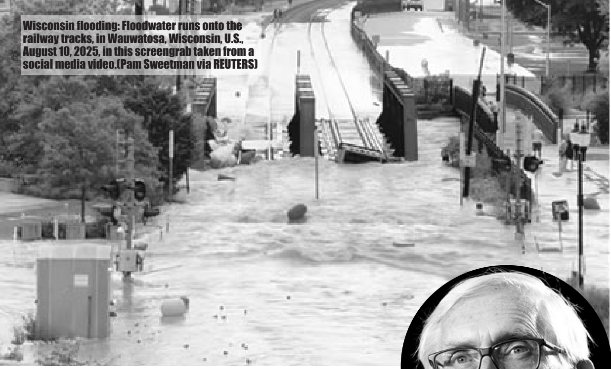
Wisconsin flooding: Floodwater runs onto the railway tracks, in Wauwatosa, Wisconsin, U.S., August 10, 2025, in this screengrab taken from a social media video.