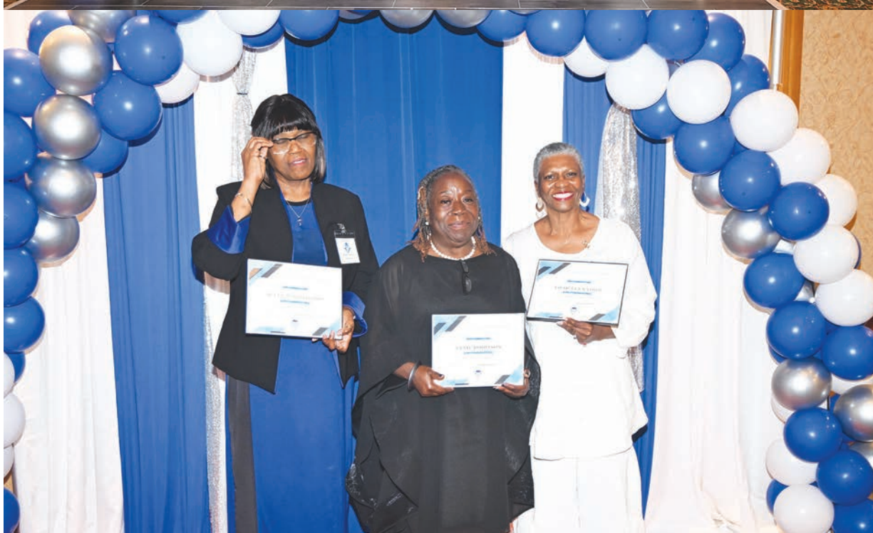
Recently, the North Division Blue Devils Class of 1975 held its 50 year class reunion at Milwaukee's Hilton Park Place. The weekend was capped-off with a bowling outing and church service at Macedonia church.