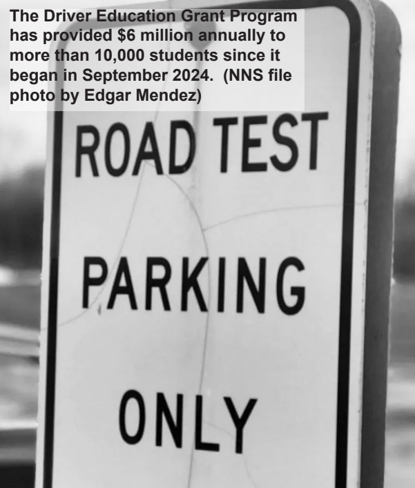
The Driver Education Grant Program has provided $6 million annually to more than 10,000 students since it began in September 2024.

"This grant program will reduce racial and economic disparities around access to driver education and the ability to obtain a driver's license," the organization said in an Aug. 25 news release.