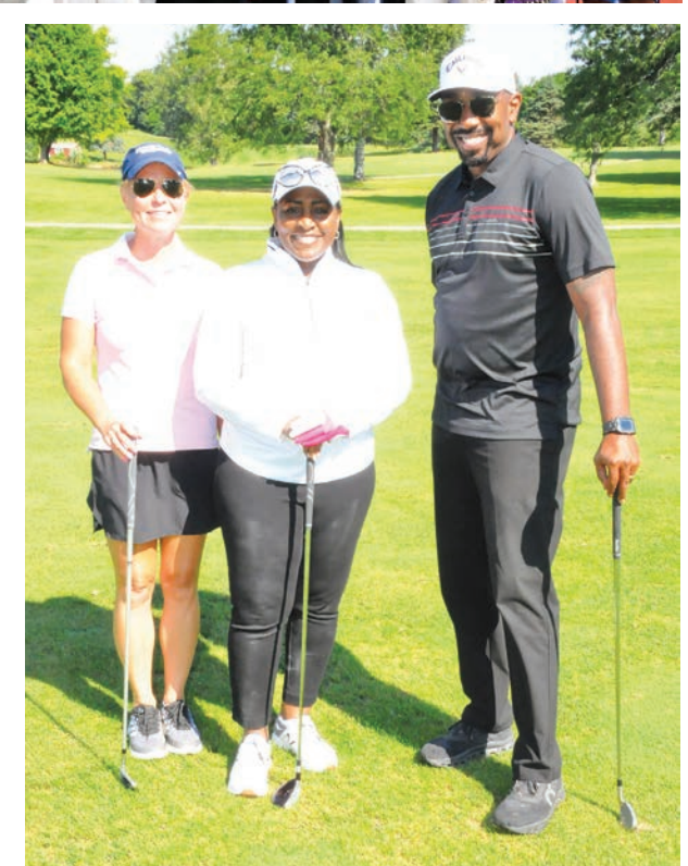
"The 25th annual Fellowship Open has been drawing attention and participation from some of America's most revered athletes, respected leaders, and influential figures in government, business, professional sports, African American arts entertainment."