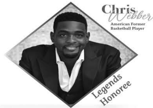
Chris Webber American Former Basketball Player