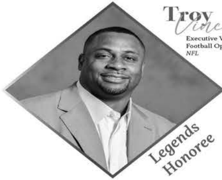
Troy Vincent Executive Vice President of Football Operations NFL

Congratulations to the Fellowship Open, its Sponsors, and its Honorary Chairs on successfully promoting urban, youth programs and involvement in business. The Fellowship Open's mission recognizes volunteers and organizations that positively impact our community's youth. In the past 25 years, the Fellowship Open has raised more than $4.5 million for youth organizations, involving more than 160 organizations throughout Wisconsin.