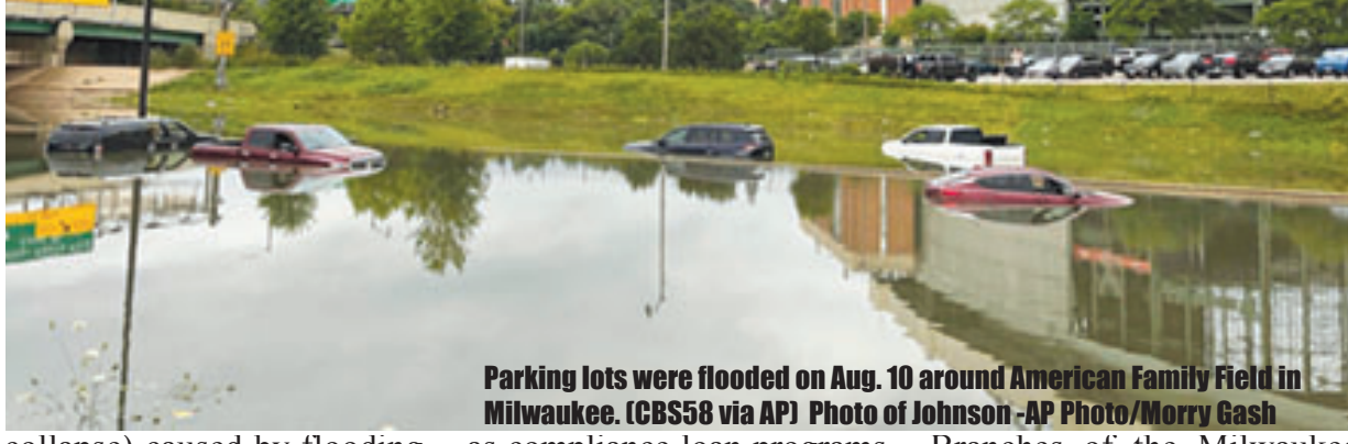
Parking lots were flooded on Aug. 10 around American Family Field in Milwaukee. Photo of Johnson

collapse) caused by flooding, they can get in touch with DNS's Condemnation team via email (preferred) or by phone at 414-286-2795. It's a work in progress.