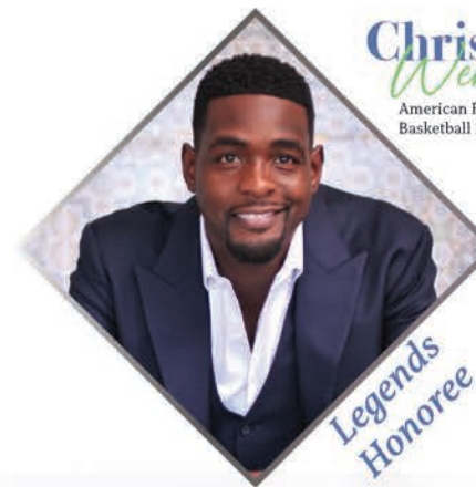
Chris Webber American Former Basketball Player