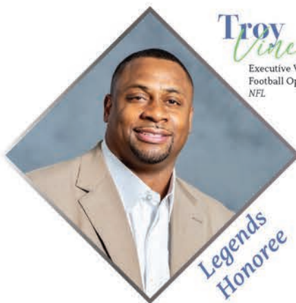
Troy Vincent Executive Vice President of Football Operations NFL

Congratulations to the Fellowship Open, its Sponsors, and its Honorary Chairs on successfully promoting urban, youth programs and involvement in business. The Fellowship Open's mission recognizes volunteers and organizations that positively impact our community's youth. In the past 25 years, the Fellowship Open has raised more than $4.5 million for youth organizations, involving more than 160 organizations throughout Wisconsin.