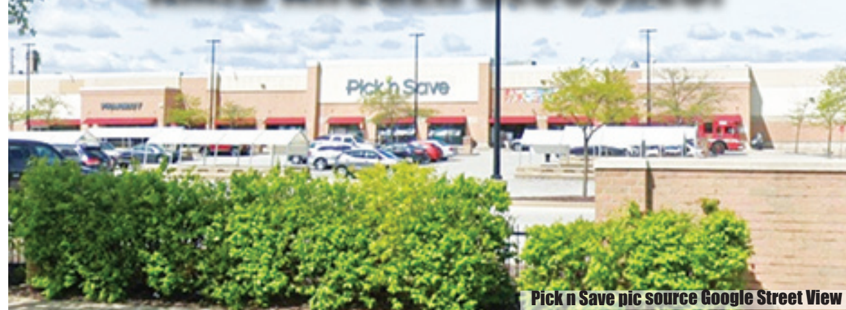
Pick n Save

Residents of Milwaukee are rallying to keep their local Pick 'n Save grocery stores open after Kroger announced plans to shutter several locations, including the store at 35th and Meinecke slated to close on July 18.