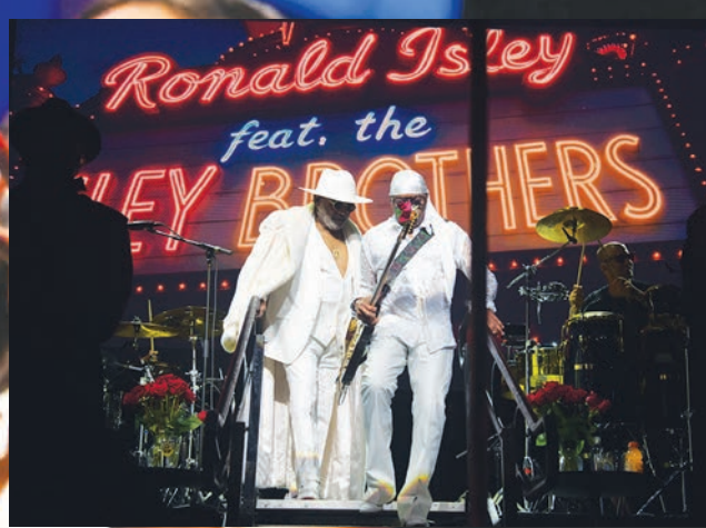
On Thursday, June 19th, JUNETEENTH DAY, the celebration of freedom, made a detour to the lakefront and the Summerfest grounds where, on the BMO Pavilion stage Eric Benet and the legendary Isley Brothers performed before an enthusiastic audience.