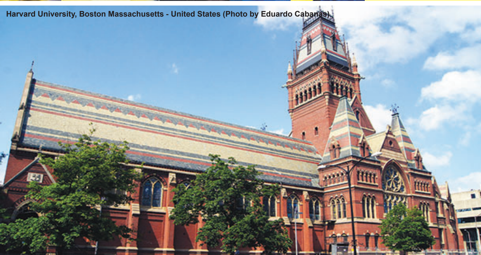
Harvard University, Boston Massachusetts - United States