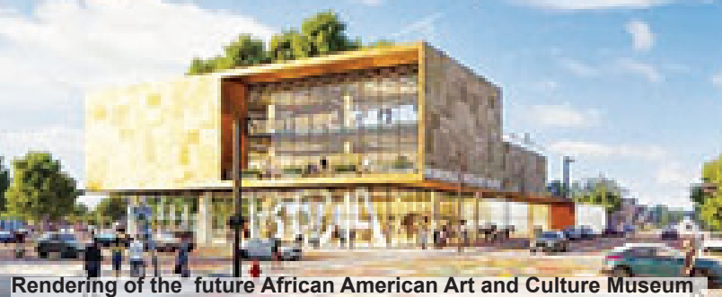
Rendering of the future African American Art and Culture Museum community to be part of every stage of the process.”

The museum will be a cornerstone of the revitalization efforts in the historic Bronzeville district, helping to drive cultural tourism, community engagement, and economic development.