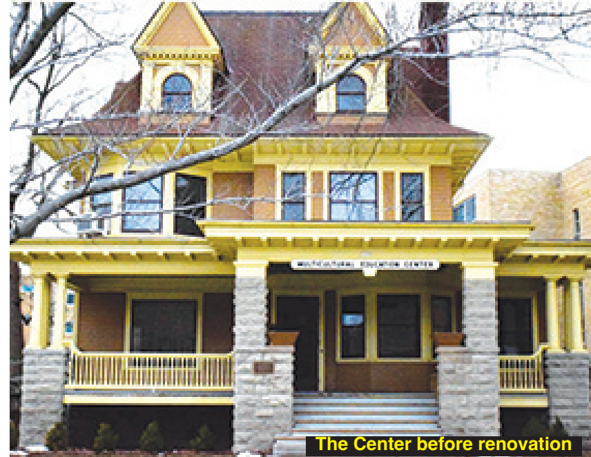
The Center before renovation

BULK RATE U.S. POSTAGE MILWAUKEE, WISCONSIN PERMIT 4668