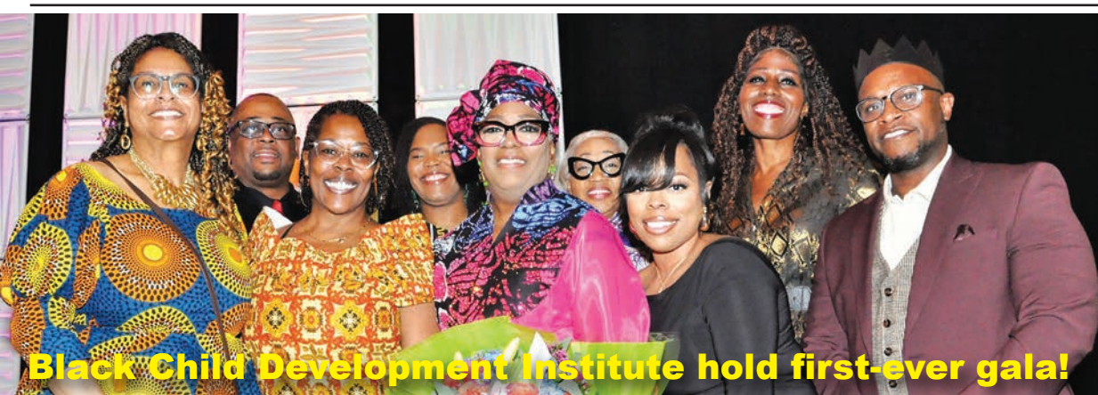
Black Child Development Institute hold first-ever gala!