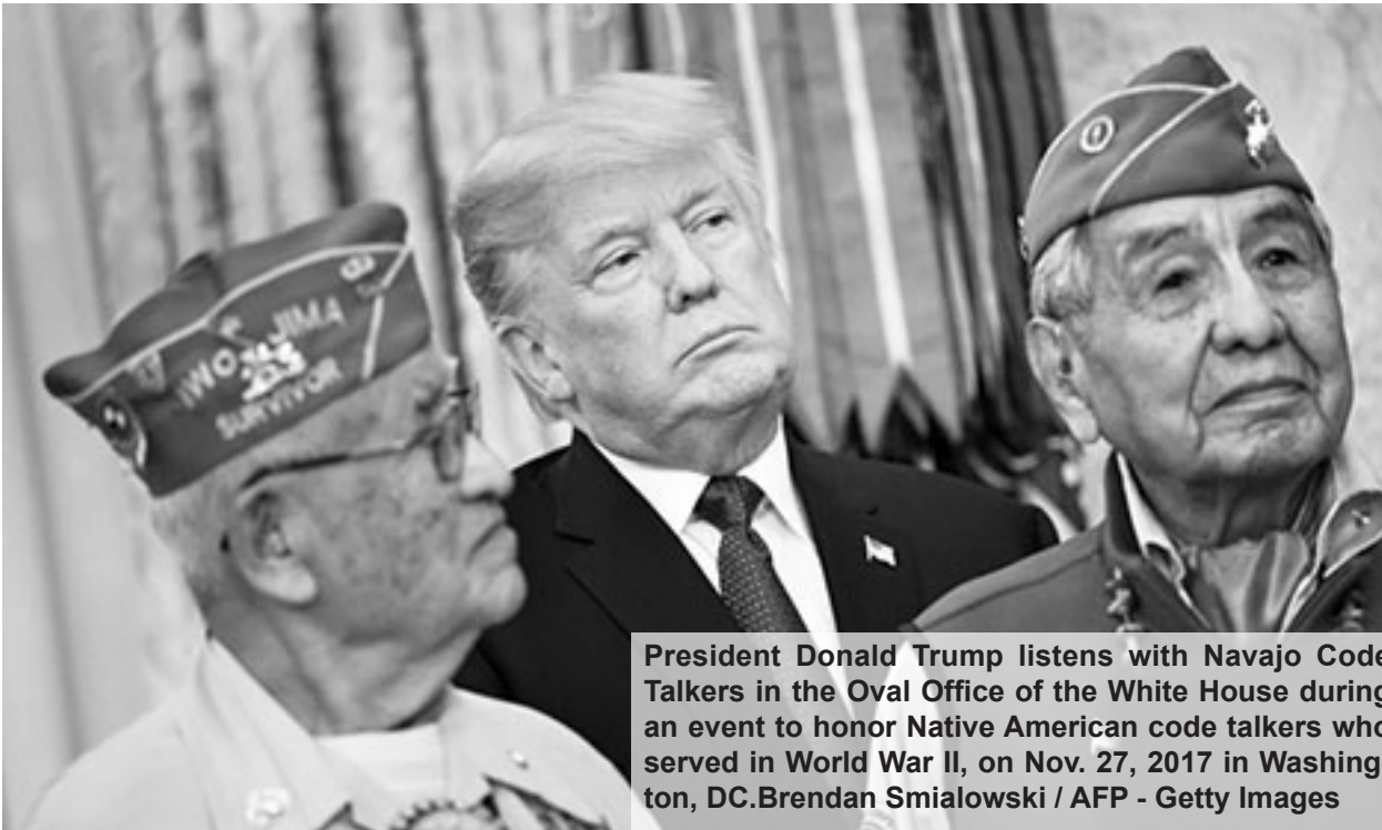
President Donald Trump listens with Navajo Code Talkers in the Oval Office of the White House during an event to honor Native American code talkers who served in World War II, on Nov. 27, 2017 in Washington, DC.