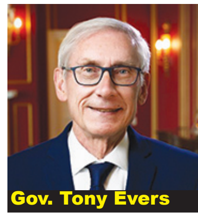
Gov. Tony Evers

"Far too many Wisconsinites feel the pressure of rising healthcare costs and feel like they're not getting a fair