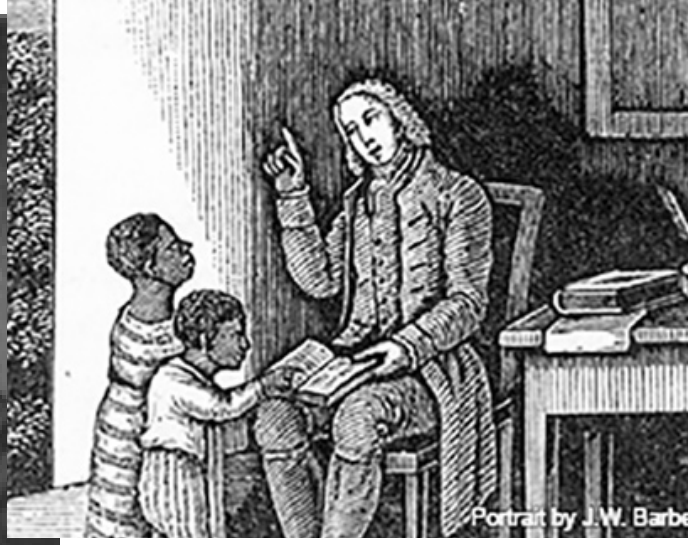
Illustration of Anthony Benezet teaching free Black children from what looks like the Bible.

“Benezet is an essential figure in the battle to end ‘American apartheid.’ He was the Lone Caucasian Ranger who upset Christianity’s tenets on slavery, calling into question its doctrine that posited God’s supposed approval of slavery versus love for humankind—neighbors—regardless of color.”