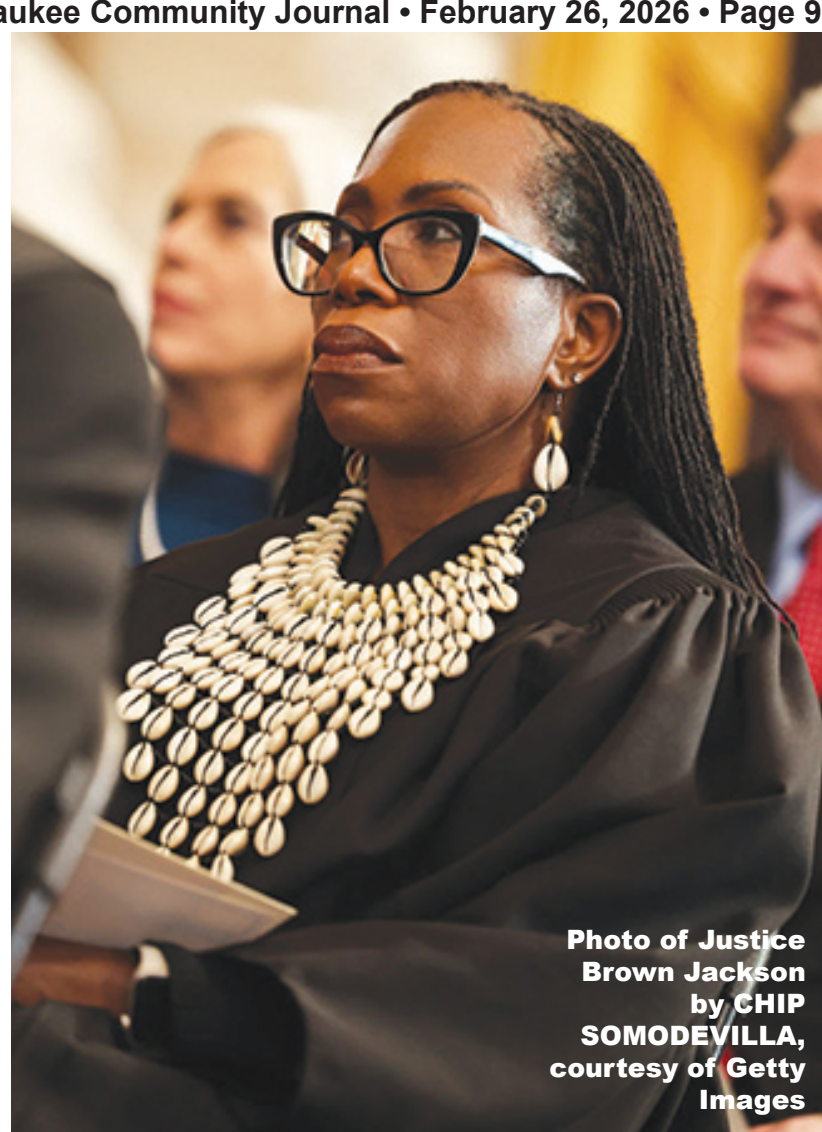
Photo of Justice Brown Jackson

Black women are particularly vulnerable under the new administration. These tiny shells are symbols of abundance, safety, power, and connection for Black people at a time when we need these values the most.