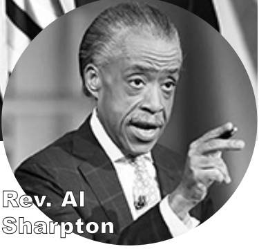
Rev. Al Sharpton

Civil Rights leader Rev. Al Sharpton expressed concern recently about the U.S. Department of Justice's decision to drop charges against New York Mayor Eric Adams, stating that it appears President Trump is holding the mayor hostage. "I am concerned about last night's developments, particularly that this directive says the mayor should not go to trial so he can work on President Trump's pol-