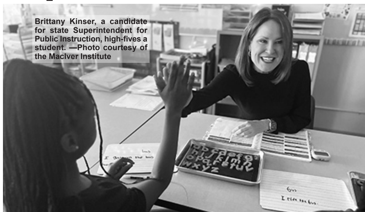
Brittany Kinser, a candidate for state Superintendent of Public Instruction, high-fives a student.

To call that transformation (and its resulting impact on academic achievement) phenomenal is an understatement. It is