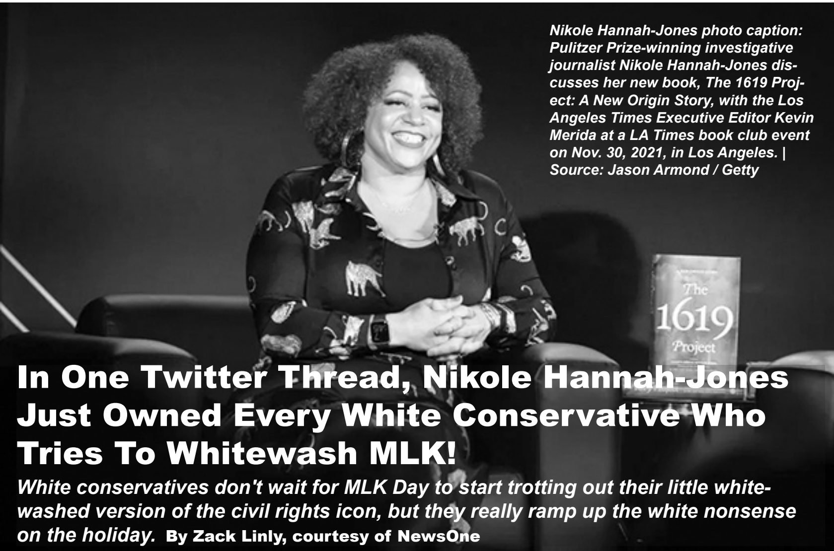
Nikole Hannah-Jones photo caption: Pulitzer Prize-winning investigative journalist Nikole Hannah-Jones discusses her new book, The 1619 Project: A New Origin Story, with the Los Angeles Times Executive Editor Kevin Merida at a LA Times book club event on Nov. 30, 2021, in Los Angeles.