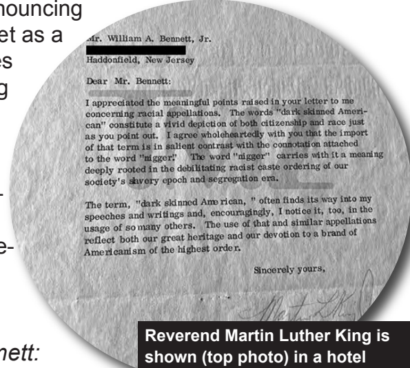
Reverend Martin Luther King is shown (top photo) in a hotel room as he prepares a speech he will deliver to the National Conference on religion and race there January 17, 1963. Picture above is a screen shot of the original letter that is to be auctioned off.

Sincerely yours, Martin Luther King, Jr.