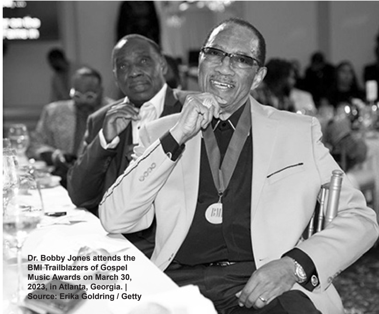
Dr. Bobby Jones attends the BMI Trailblazers of Gospel Music Awards on March 30, 2023, in Atlanta, Georgia.