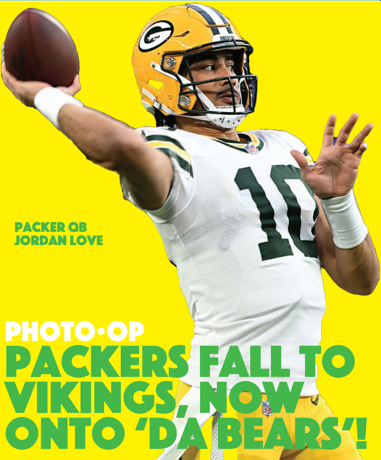
PACKER QB JORDAN LOVE

Milwaukee community fights back against White supremacist flyers!