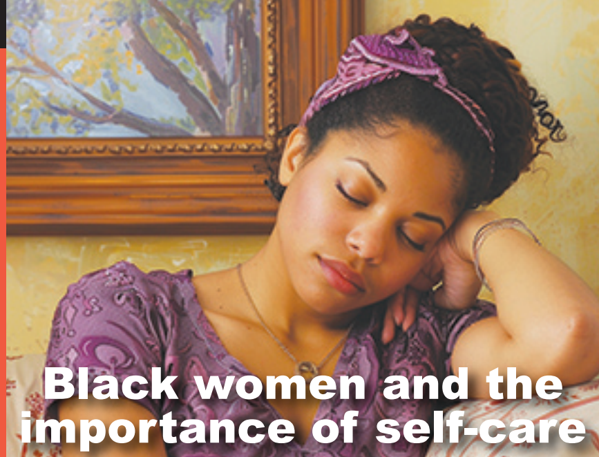
Black women and the importance of self-care

BULK RATE U.S. POSTAGE MILWAUKEE, WISCONSIN PERMIT 4668