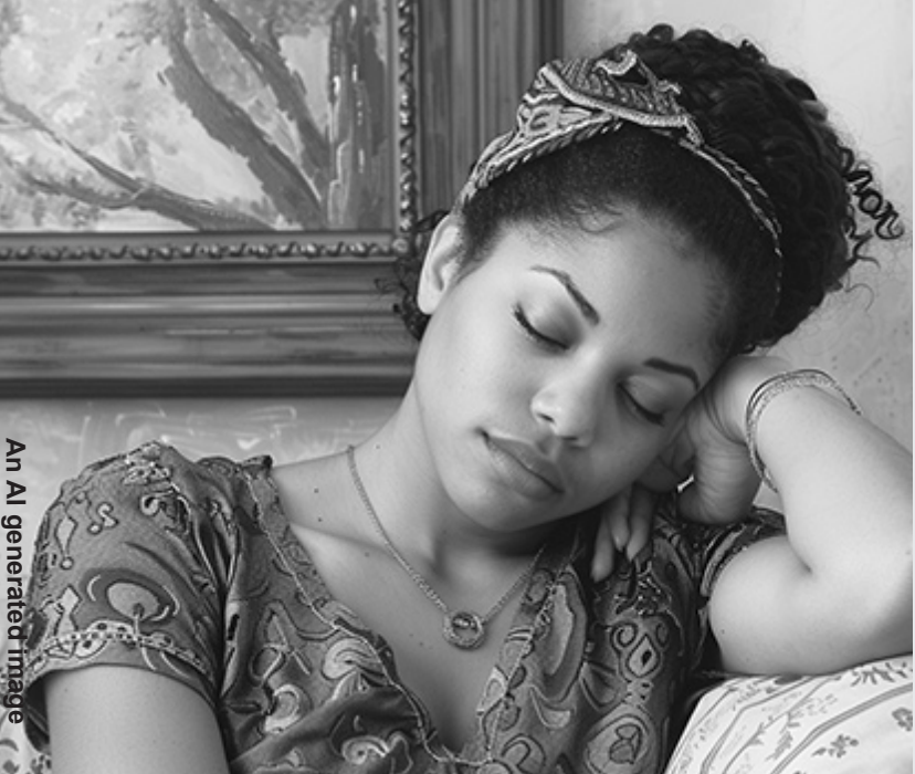
An AI generated image