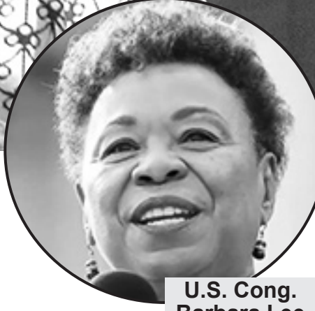
U.S. Cong. Barbara Lee