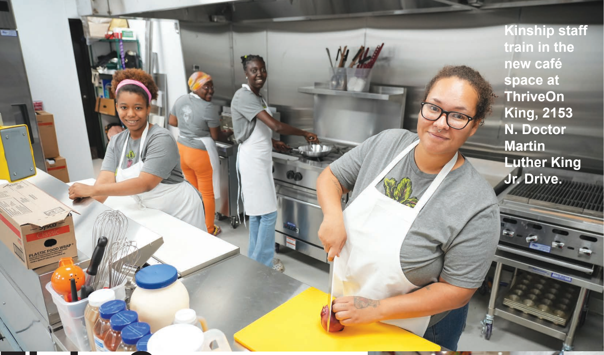
Kinship staff train in the new café space at ThriveOn King, 2153 N. Doctor Martin Luther King Jr. Drive.