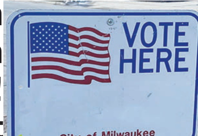
A sign marks the polling place at Audubon High School, 3300 S. 39th St., across from Alverno College, in spring 2024. The November election includes races for the offices of president, Congress and the state legislature.

There's an election coming up! Here's what you need to know!