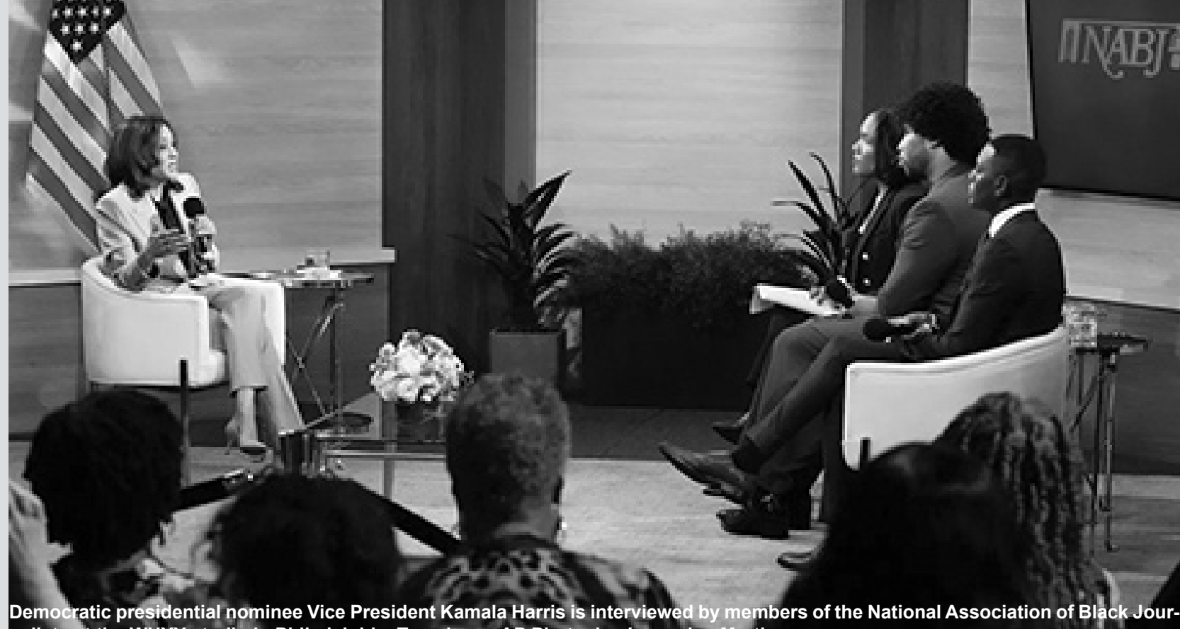
Democratic presidential nominee Vice President Kamala Harris is interviewed by members of the National Association of Black Journalists at the WHYY studio in Philadelphia, Tuesday.

She also committed to supporting a two-state resolution to the ongoing conflict in Gaza, calling for a ceasefire,