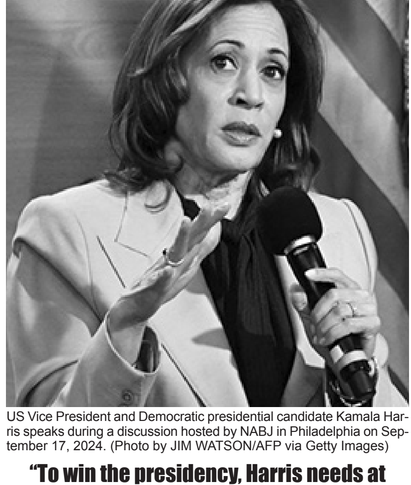
US Vice President and Democratic presidential candidate Kamala Harris speaks during a discussion hosted by NABJ in Philadelphia on September 17, 2024.

"And we gotta say that you cannot be entrusted with standing behind the seal of the President of the United States of