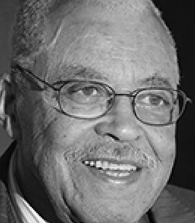
James Earl Jones

connected hundreds of kins-folks to jobs and fed us news on the internal workings of city hall, had died.