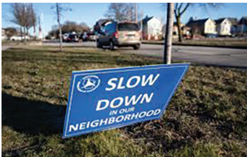
Silver Spring Drive

NORTHWEST SIDE MEETING: Tuesday, September 24, 6:00PM-7:30PM Milwaukee Public Library, Good Hope Branch 7715 Good Hope Rd. Milwaukee, WI 53223 Accessible on MCTS Route 76 Featured Corridors of Concern: N. 60th Street, N. 76th Street, N. 91st Street-N. 92nd Street, Good Hope Road, Mayfair Road-N. Lovers Lane Road,