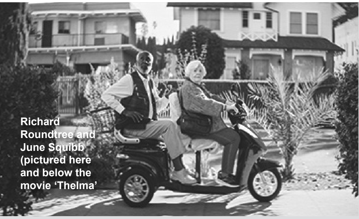
Richard Roundtree and June Squibb (pictured here and below the movie 'Thelma')