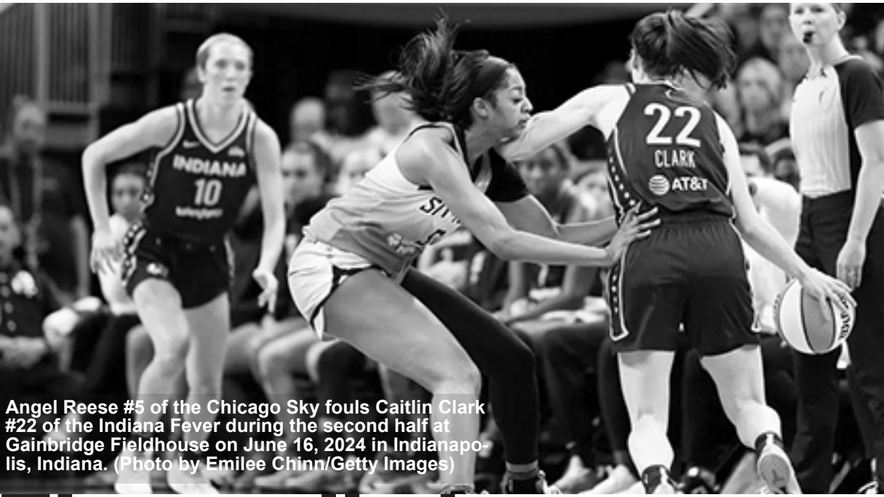
Angel Reese #5 of the Chicago Sky fouls Caitlin Clark #22 of the Indiana Fever during the second half at Gainbridge Fieldhouse on June 16, 2024 in Indianapolis, Indiana.