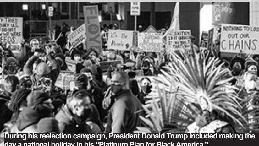
During his reelection campaign, President Donald Trump included making the day a national holiday in his "Platinum Plan for Black America."

"Elimination of qualified immunity, more funding for mental health services, and more oversight of police forces were things most political leaders didn't want to do; they feared it would upset their chances for reelection and change the dynamic of police protection that evolved from controlling immigrants and slave patrols. Leaders didn't want to take action; they needed a distraction; they needed Juneteenth."