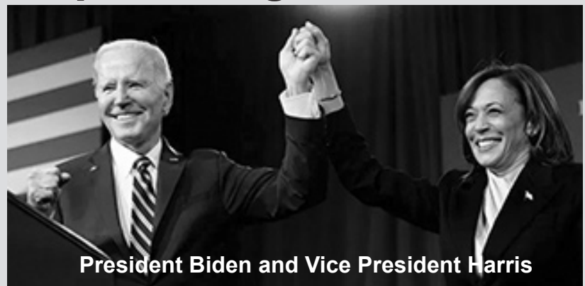
President Biden and Vice President Harris