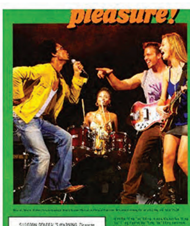
Left: Illustration of "Jim Crow," the immensely popular blackface minstrel character after whom the system of segregation was named. Right: 2007 ad for Newport Menthol Cigarettes. From the Newport Pleasure series.