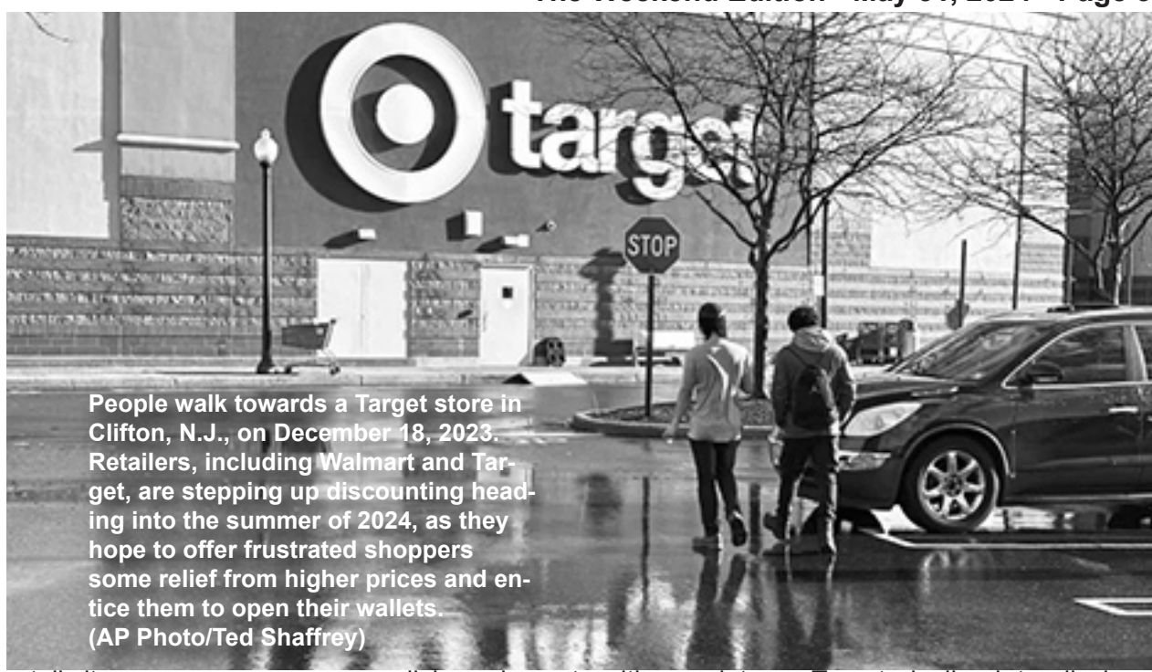
People walk towards a Target store in Clifton, N.J., on December 18, 2023. Retailers, including Walmart and Target, are stepping up discounting heading into the summer of 2024, as they hope to offer frustrated shoppers some relief from higher prices and entice them to open their wallets.

In fact, the share of online sales for the cheapest items across many categories, including clothing, groceries, personal care and appliances, increased from April 2019 to the same month this year, according to Adobe Analytics, which covers more than 1 trillion visits to U.S.