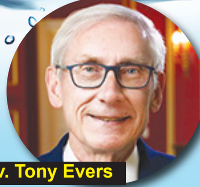
Gov. Tony Evers

Governor's latest special meeting call comes as GOP-controlled Joint Committee on Finance is poised to meet with neither item on meeting agenda despite months of delays