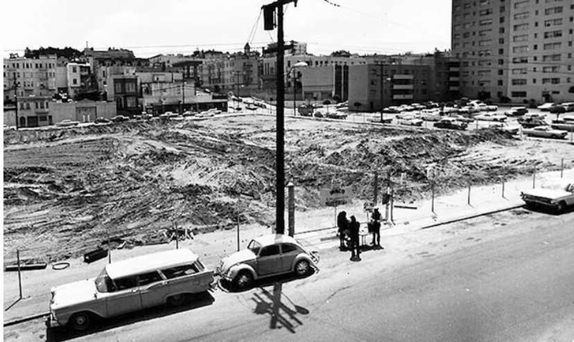
Pic of Fillmore Dist after it was demolished

were systematically denied loans to establish businesses in their own neighborhoods,