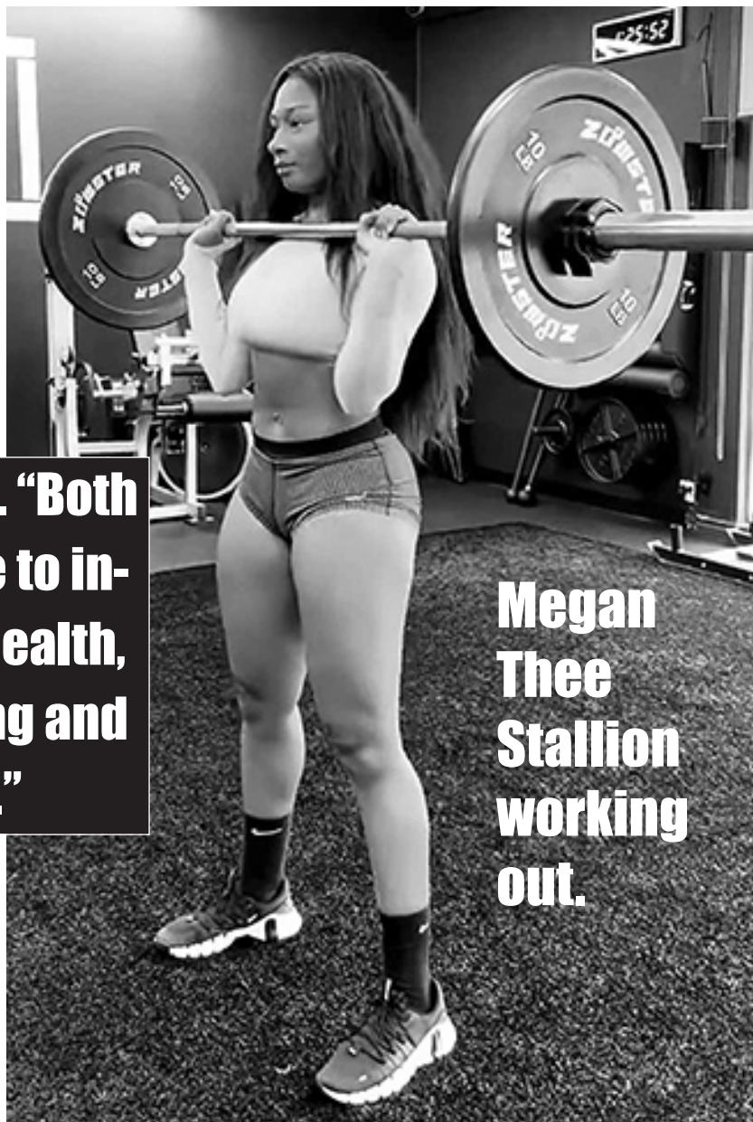
Megan Thee Stallion working out.

Available at the online Planet Fitness store, proceeds from "Thee Judgement Free" collection will go to the Pete & Thomas Foundation, a nonprofit the rapper founded focusing on education, elder care, mental health, and women's empowerment in her native Houston, Texas.