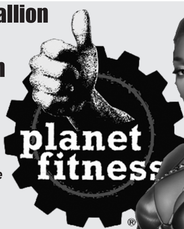
Megan Thee Stallion