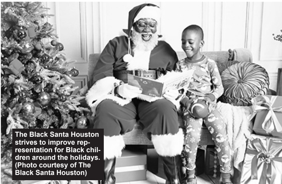
The Black Santa Houston strives to improve representation for Black children around the holidays.

"So years from now, when these kids look at these pictures, whether they're laughing in the picture or crying, it's going to be something that they reflect on, and it's gonna be a great memory for them for years to come," he said. "To just think that I'm a part of that is a very