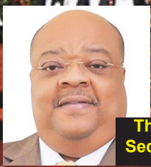
The late Bishop Sedgwick Daniels

Introspection is the examination of one's conscious thoughts and feelings. Introspection is when a person closely reflects on and examines their soulful nature. It's when one honestly observes and begins to regulate their mental state".