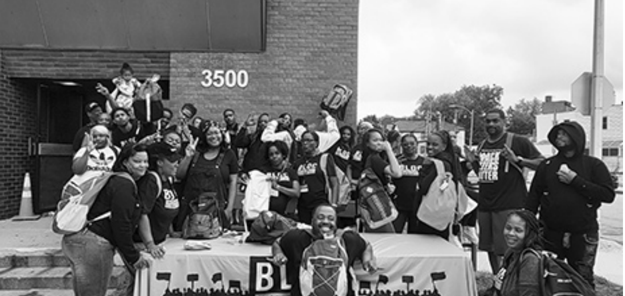
Black Leaders Organizing Communities (BLOC) recently held a bookbag giveaway at a Milwaukee central city church. Created in 2017 to ensure a high quality of life and access to opportunities for members of the Black community. They do this by going door to door and talking directly to residents about issues that are important to them.