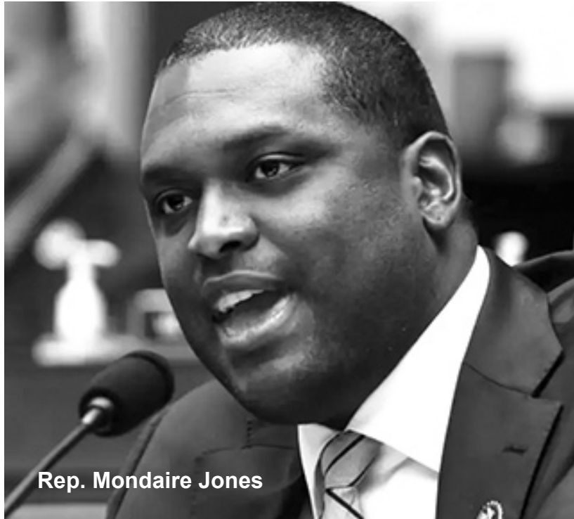
Rep. Mondaire Jones