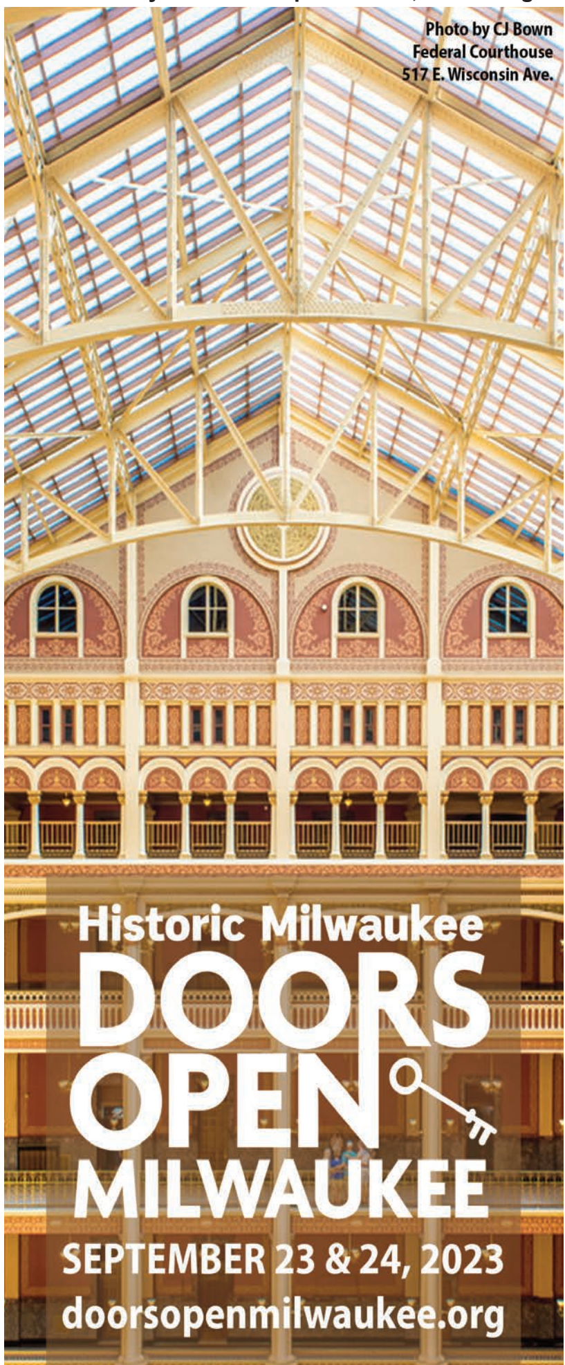
Federal Courthouse 517 E. Wisconsin Ave.

More information on sponsorships, tickets, and other details can be found at tmul.org in the Black and White Ball section.