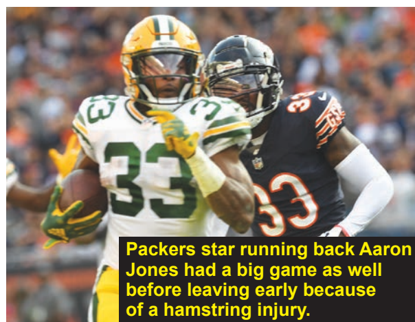
Packers star running back Aaron Jones had a big game as well before leaving early because of a hamstring injury.