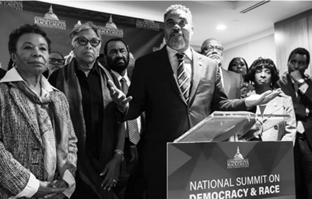
Rep. Steven Horsford, D-Nev., chairman of the Congressional Black Caucus, conducts a news conference following the CBC’s National Summit on Democracy & Race near Capitol Hill on Tuesday, May 9, 2023.