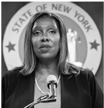
NY Atty. General James