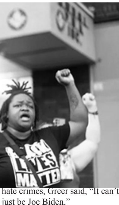
Demonstrators participate in a march against white supremacy on August 28, 2023 in Jacksonville, Florida.

When it comes to addressing white domestic terrorism and