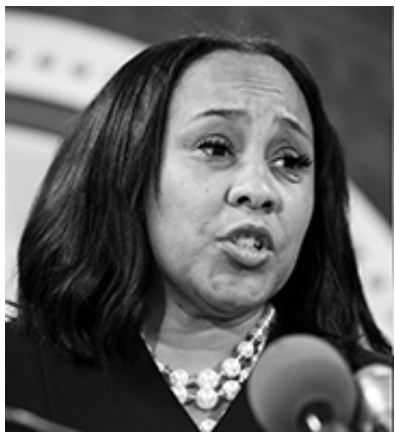
Fulton Cnty D.A. Fani Willis