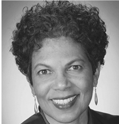
Fed. Judge Tanya Chutkan

are too "passive" in their response as it pertains to the criticisms Black prosecutors and lawyers face in the current political climate that Trump continues to dominate.