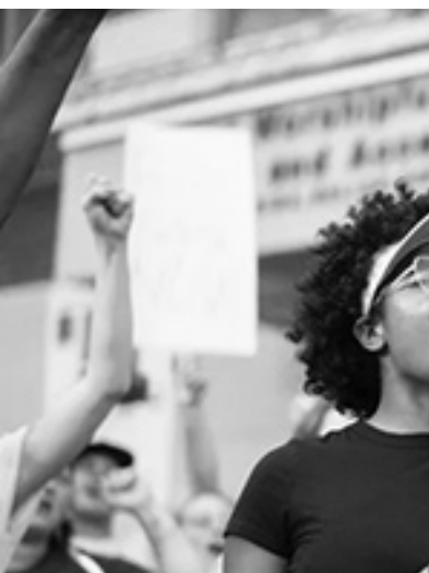
Demonstrators participate in a march against white supremacy on August 28, 2023 in Jacksonville, Florida.

Some of those prosecutions include the current and former Louisville Metro Police Depart-