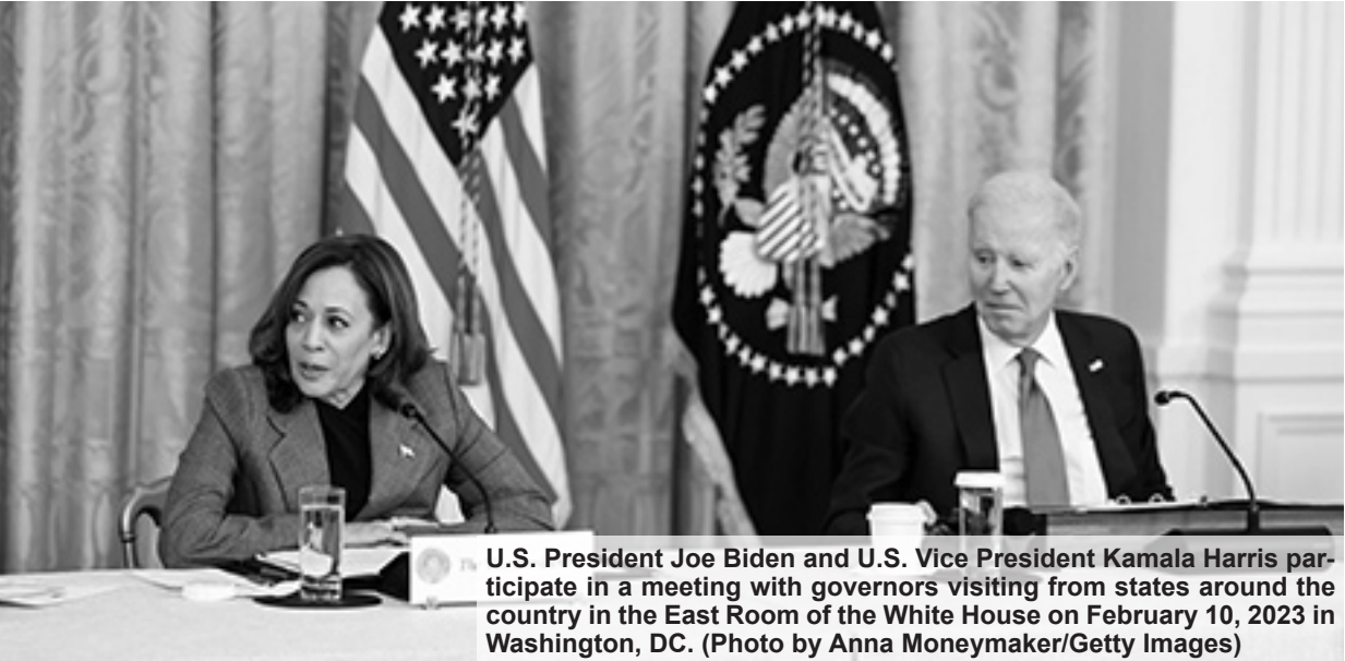
U.S. President Joe Biden and U.S. Vice President Kamala Harris participate in a meeting with governors visiting from states around the country in the East Room of the White House on February 10, 2023 in Washington, DC.