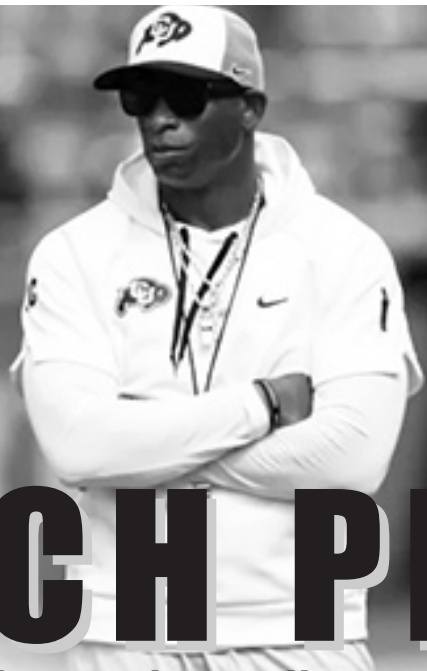
Head coach Deion Sanders of the Colorado Buffaloes walks the field before the game between the TCU Horned Frogs and the Colorado Buffaloes at Amon G. Carter Stadium on September 2, 2023 in Fort Worth, Texas.

In his New York Times bestseller, “The Cruelty is the Point,” Adam Serwer makes the case that President Trump and his supporters find community in the suffering of those they hate and fear.