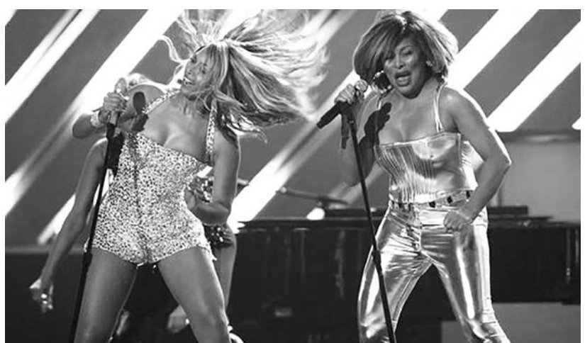
Tina Turner performs with Beyoncé at the 50th Grammy Awards in Los Angeles, February 2008.

came to their Las Vegas residency. They were a chart-making, Grammy-winning force in the 1970s – a run that came to an end when Turner left Ike, who had been consistently violent and unfaithful, in 1976. Her last single with the group was Baby, Get It On , from the 1975 film adaptation of the Who’s rock opera Tommy , in which she starred as Acid Queen , a character of the same name of her second solo album. In the divorce, finalised in 1978, Turner came away with just two cars and the rights to her stage name. “Ike fought a little bit because he knew what I would do with it,” she said in the documentary Tina . Turner, who had already released two solo records, continued pursuing a solo career, though it would take until she released her fifth album, 1984’s Private Dancer , for her to supplant the old image of the shimmying rock’n’roller – and escape premature relegation to the oldies circuit – with one of a powerful, mullet-sporting, leather-clad pop icon. In the documentary Tina , she described Private Dancer as her debut. “I don’t consider it a comeback,” she said. “Tina had never