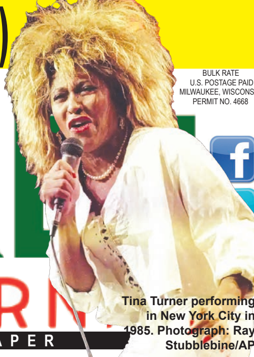
Tina Turner performing in New York City in 1985.

BULK RATE U.S. POSTAGE PAID MILWAUKEE, WISCONSIN PERMIT NO. 4668