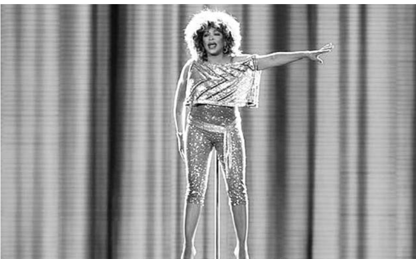
‘I was just tired of singing and making everybody happy’... Tina Turner performs at the O2 Arena, London, in 2009.

son in 1985. She published her first memoir, the global bestseller I, Tina , in 1986, which was later adapted in to the 1993 film What’s Love Got to Do With It? starring Angela Bassett as Turner. In 1995, she sang the theme tune to the James Bond film GoldenEye . Turner announced her retirement in 2000, a year after releasing her final solo album, Twenty Four Seven , though she would return to the stage in 2008, performing at the Grammy awards with Beyoncé, and for a final tour to mark 50 years of her career. That was conclusively the end. “I was just tired of singing and making everybody happy,” she