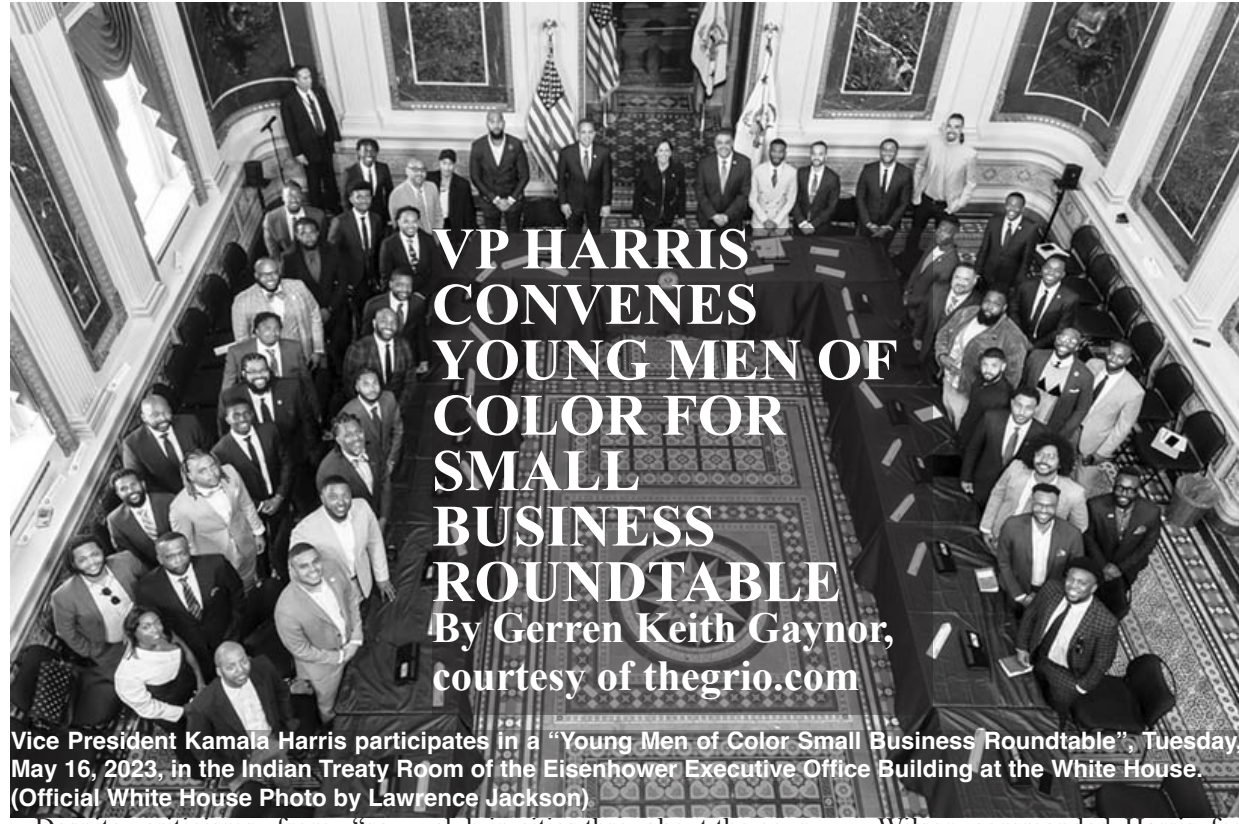
Vice President Kamala Harris participates in a "Young Men of Color Small Business Roundtable", Tuesday, May 16, 2023, in the Indian Treaty Room of the Eisenhower Executive Office Building at the White House.

"We want to give everyone an equal opportunity to compete and to not only survive but thrive," the vice president said during her opening remarks Tuesday. She emphasized that the roundtable was intended to "listen more than we talk."